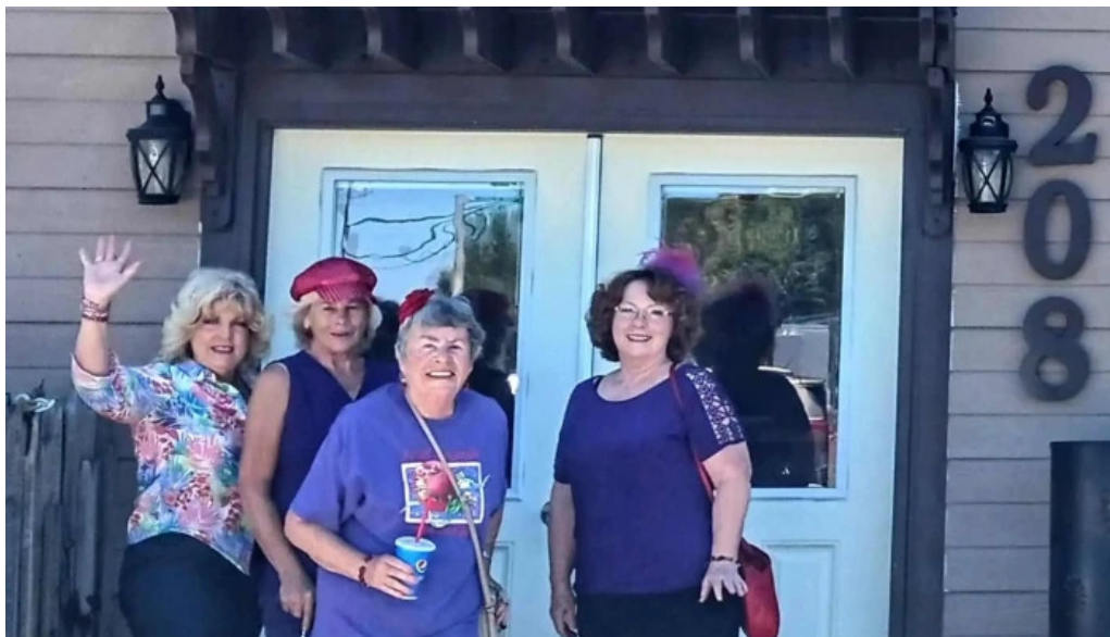
Escape the maddness instagram