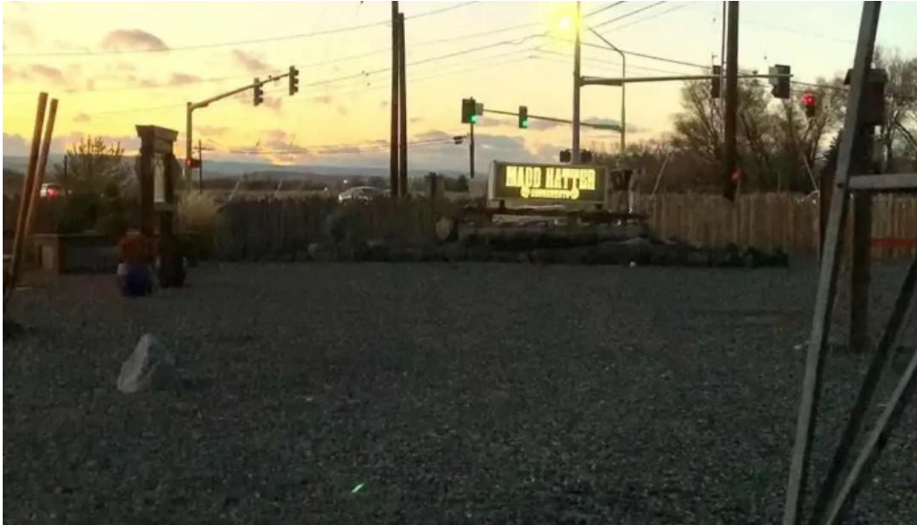
Escape the maddness by owner