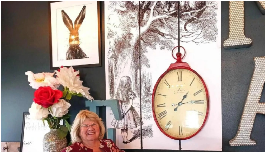
Escape the maddness area