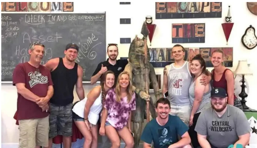
Escape the maddness all