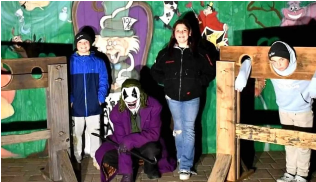
Escape the maddness reviews