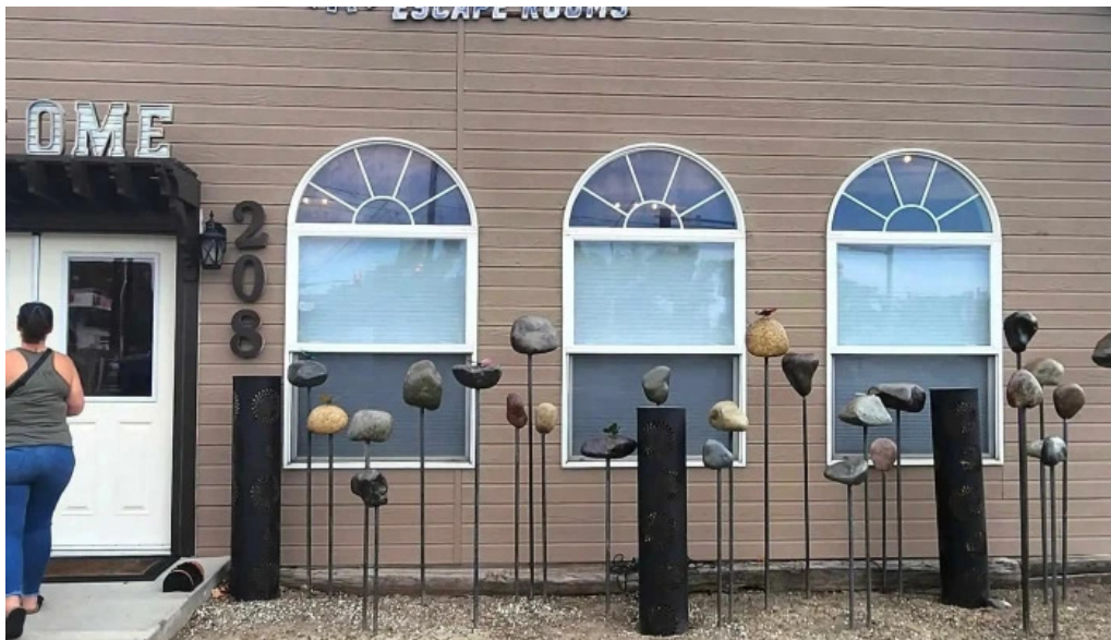
Escape the maddness amusement center