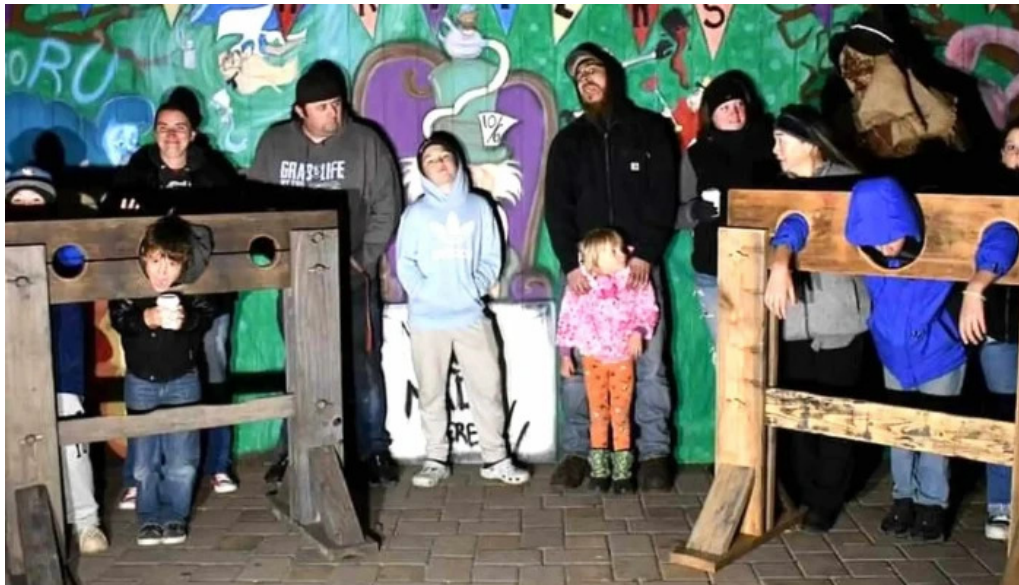
Escape the maddness where