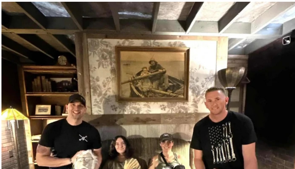
Escape the maddness union gap