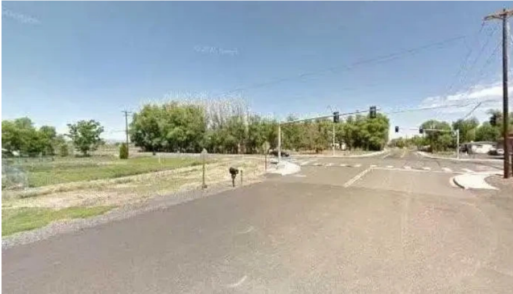
Escape the maddness street view 360deg