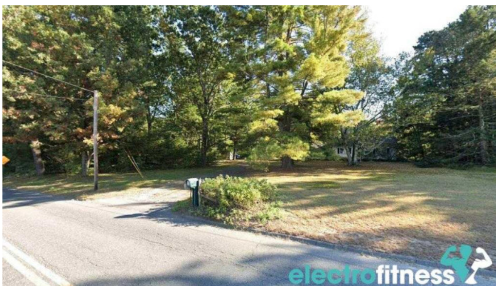
The barracks gym agawam