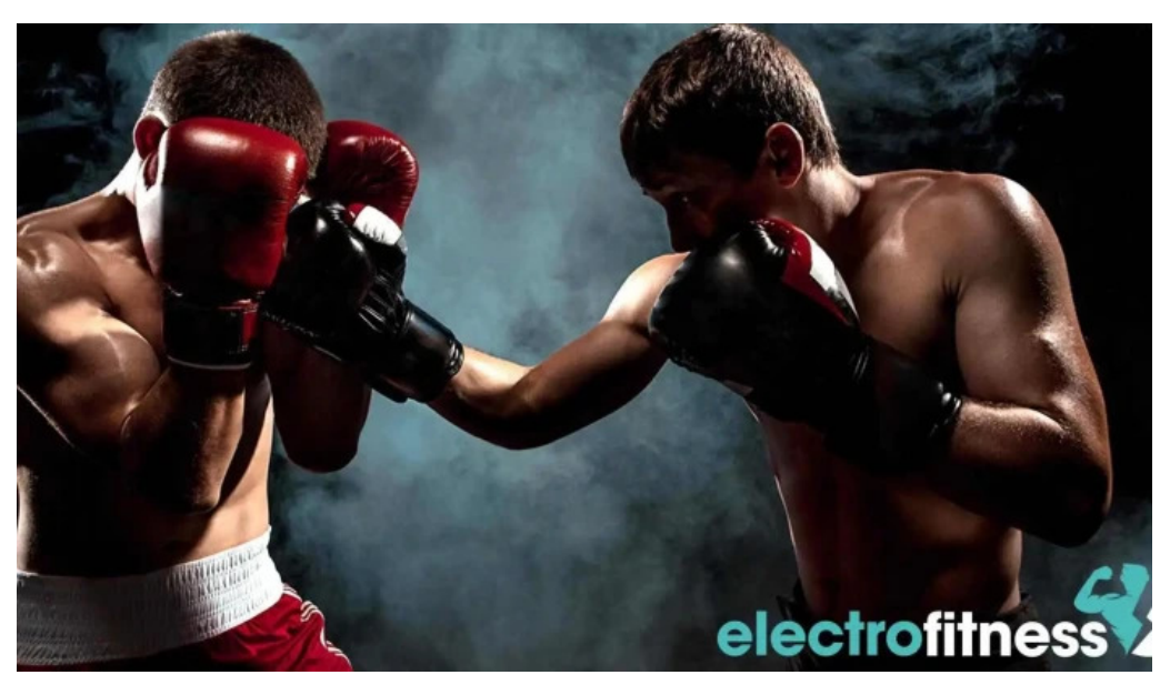
Knockout fitness all