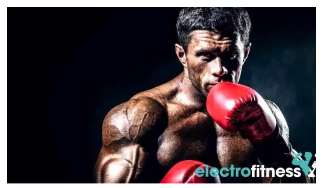
Knockout fitness by owner