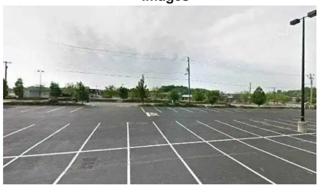
Knockout fitness street view 360deg