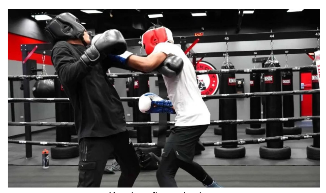
Knockout fitness boxing gym