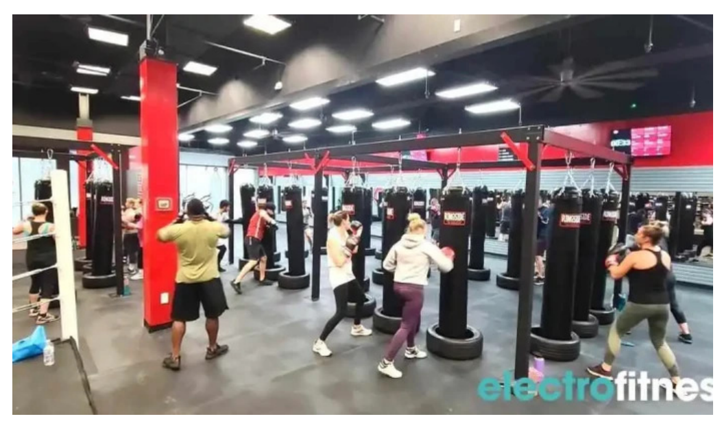
Knockout fitness gym