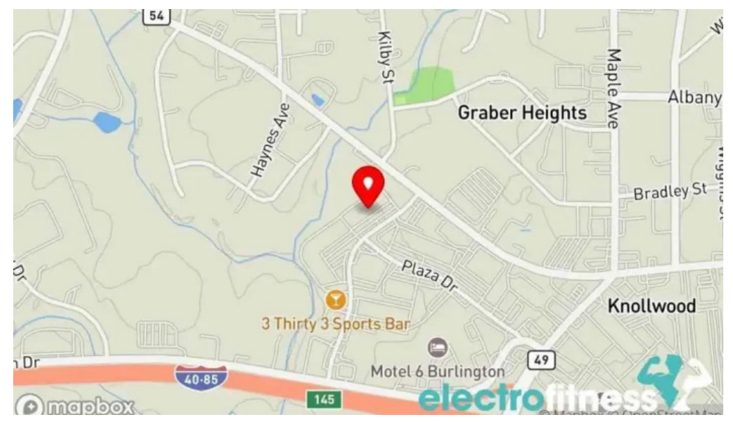
Knockout fitness map