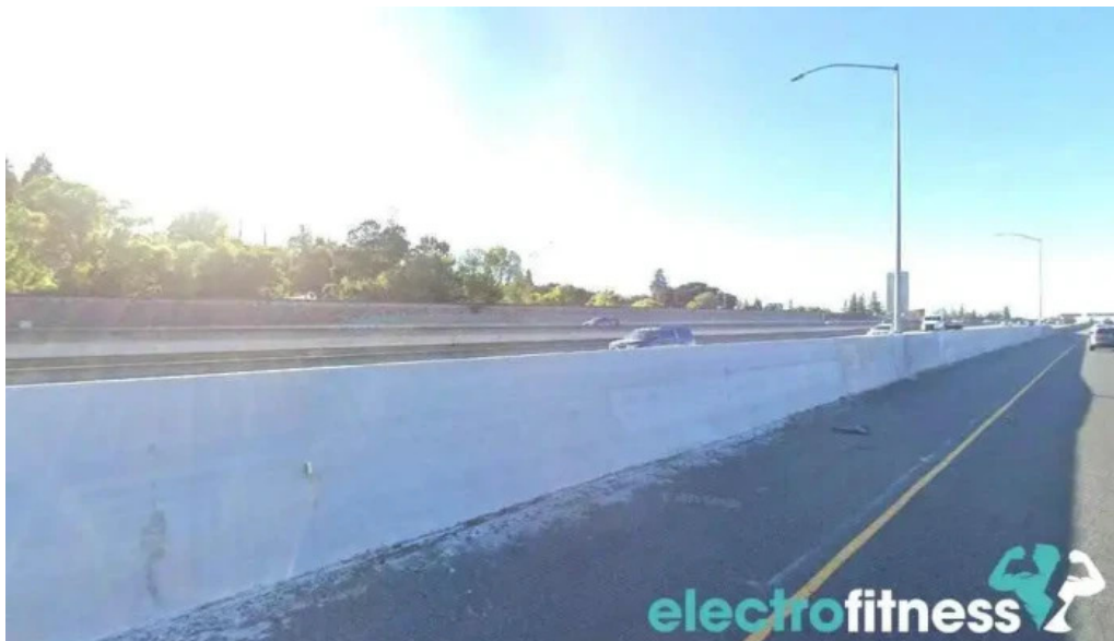
Impower sports performance and rehab walnut creek