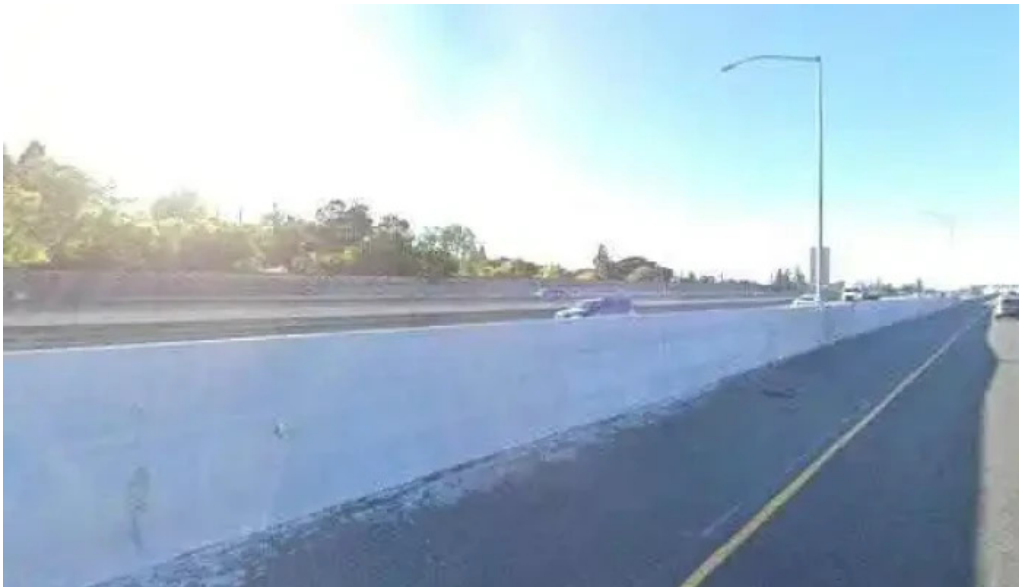
Impower sports performance and rehab all