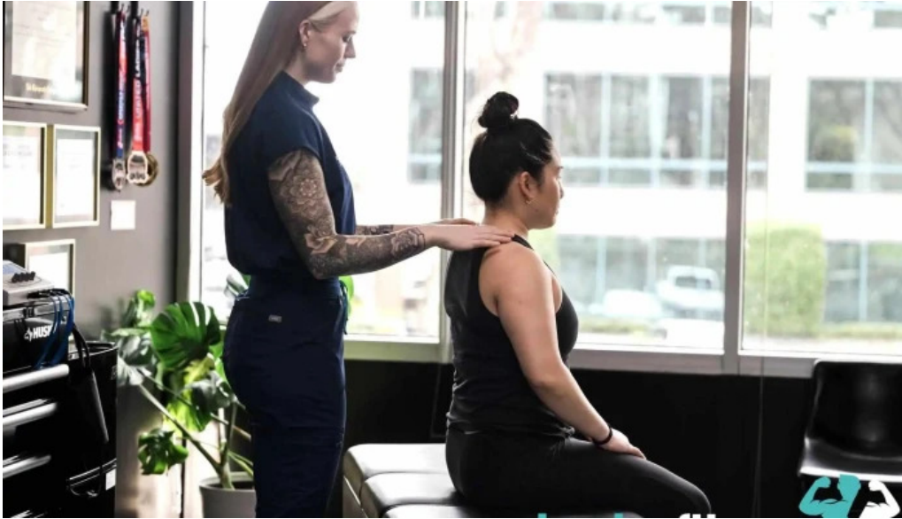
Impower sports performance and rehab by owner