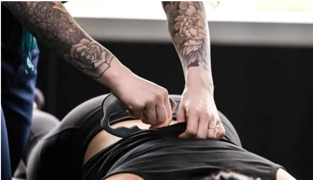
Impower sports performance and rehab latest