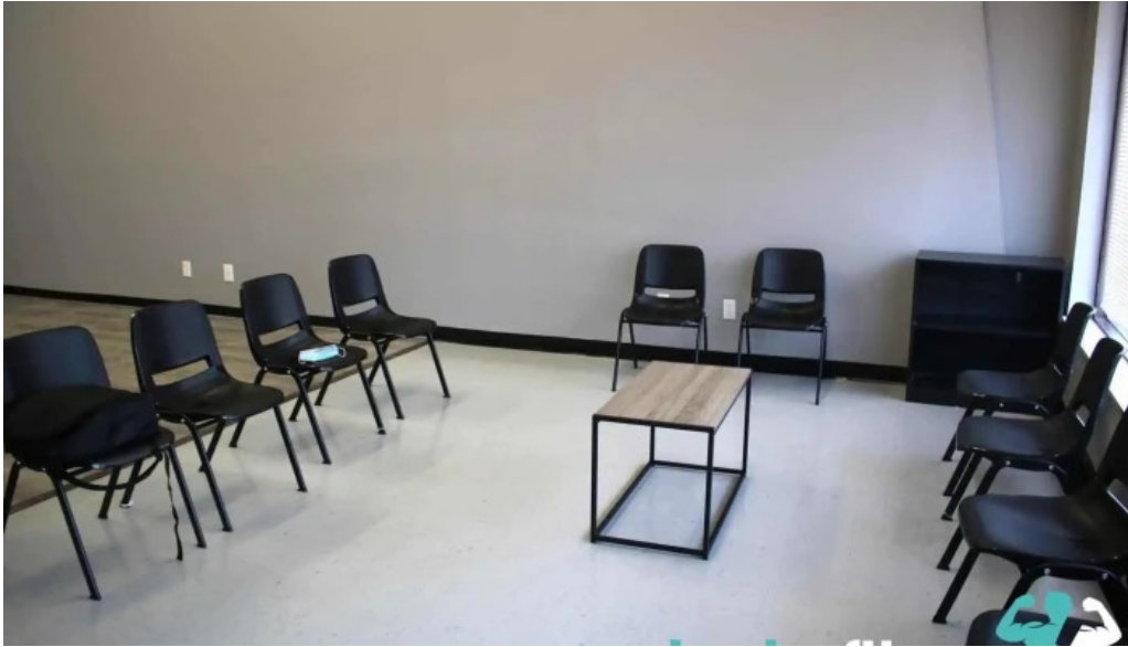
Beyond dance fitness studio by owner