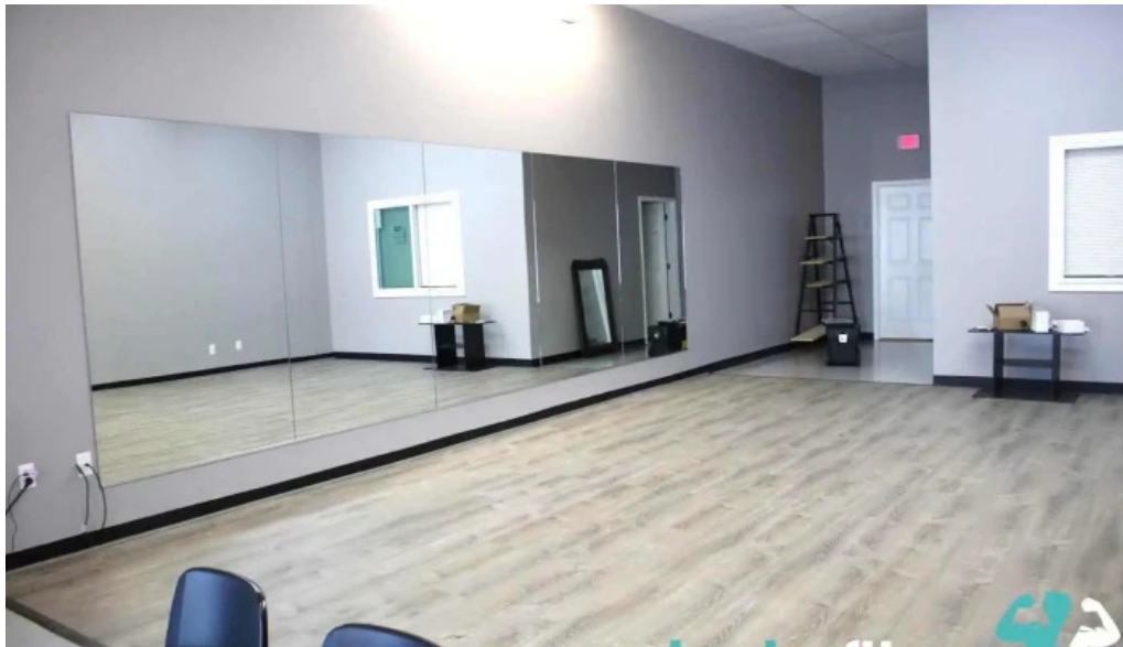
Beyond dance fitness studio aberdeen