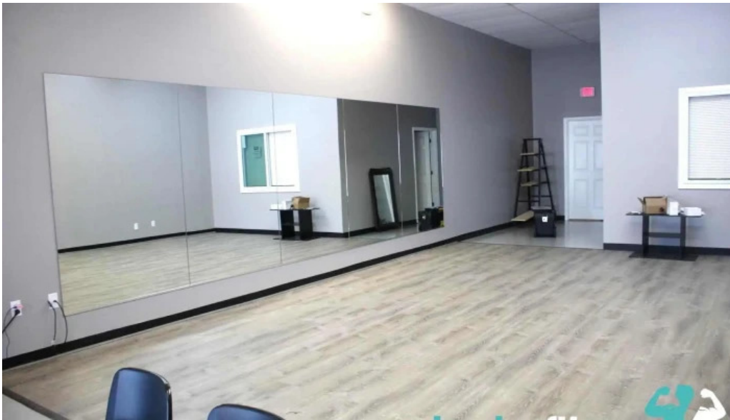
Beyond dance fitness studio all