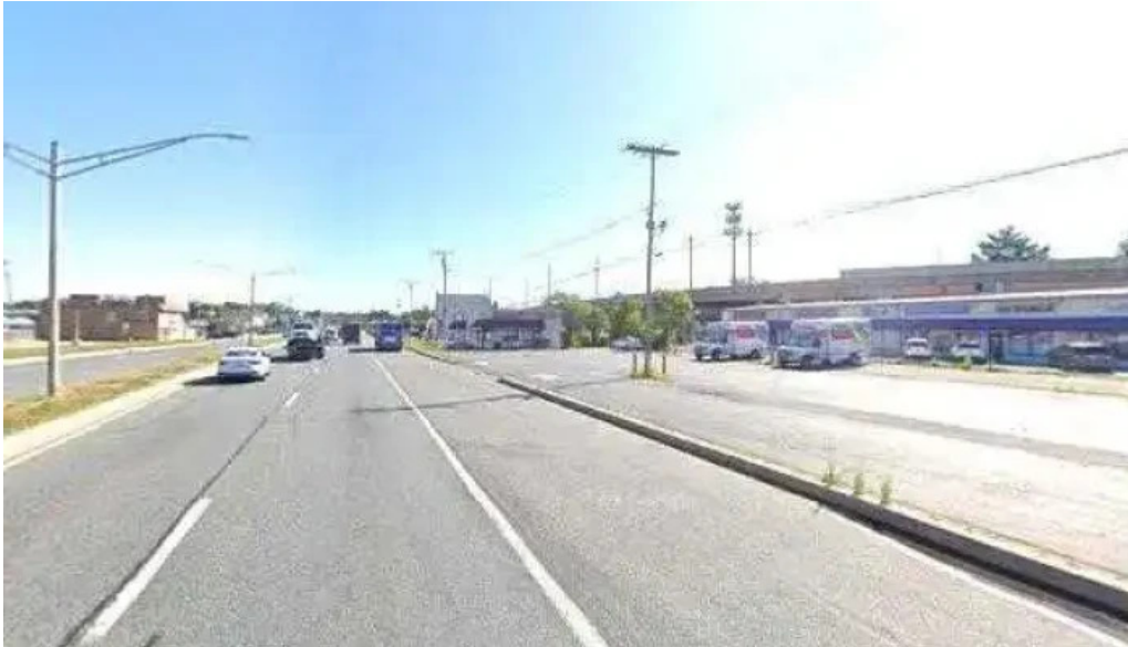
Beyond dance fitness studio street view 360