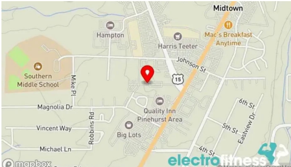
Planet fitness map