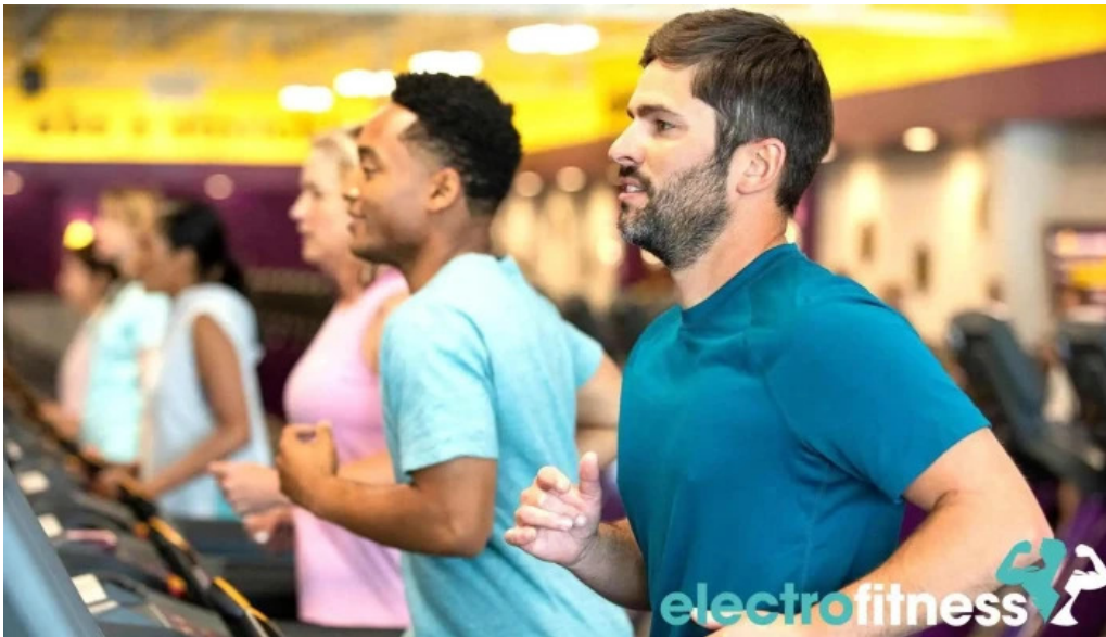
Planet fitness all