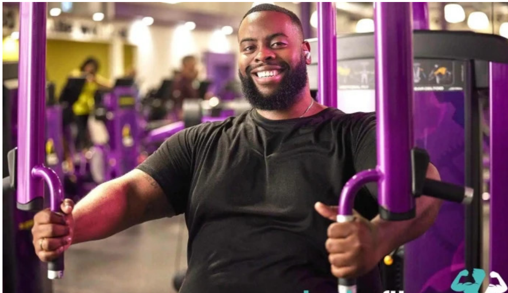
Planet fitness gym