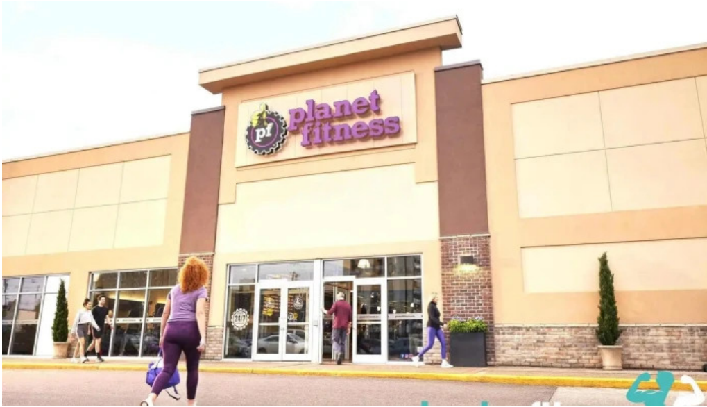
Planet fitness by owner