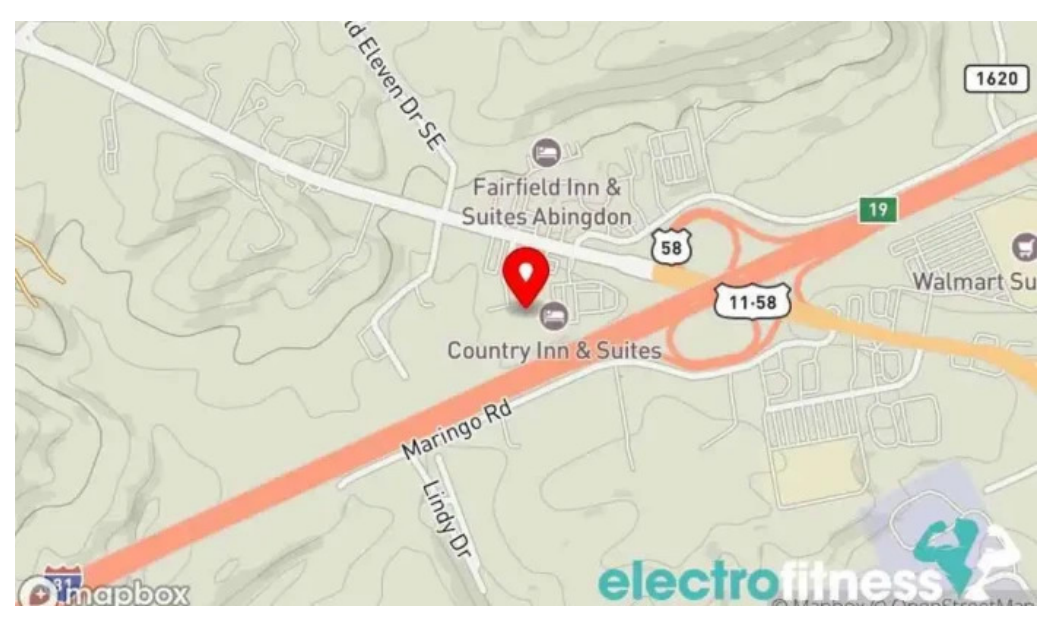
Crossfit abingdon map