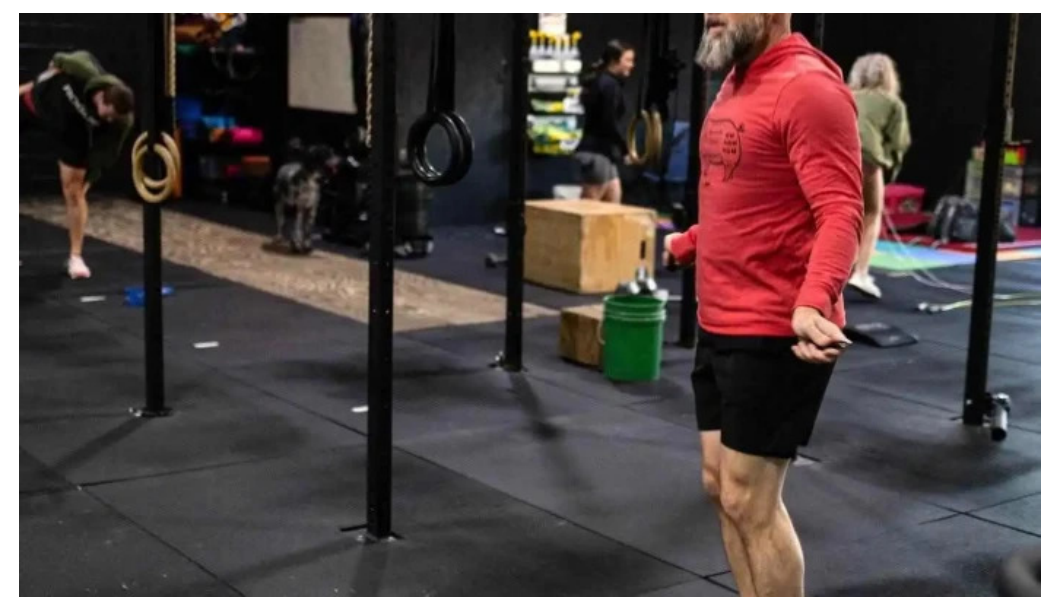
Crossfit abingdon gym