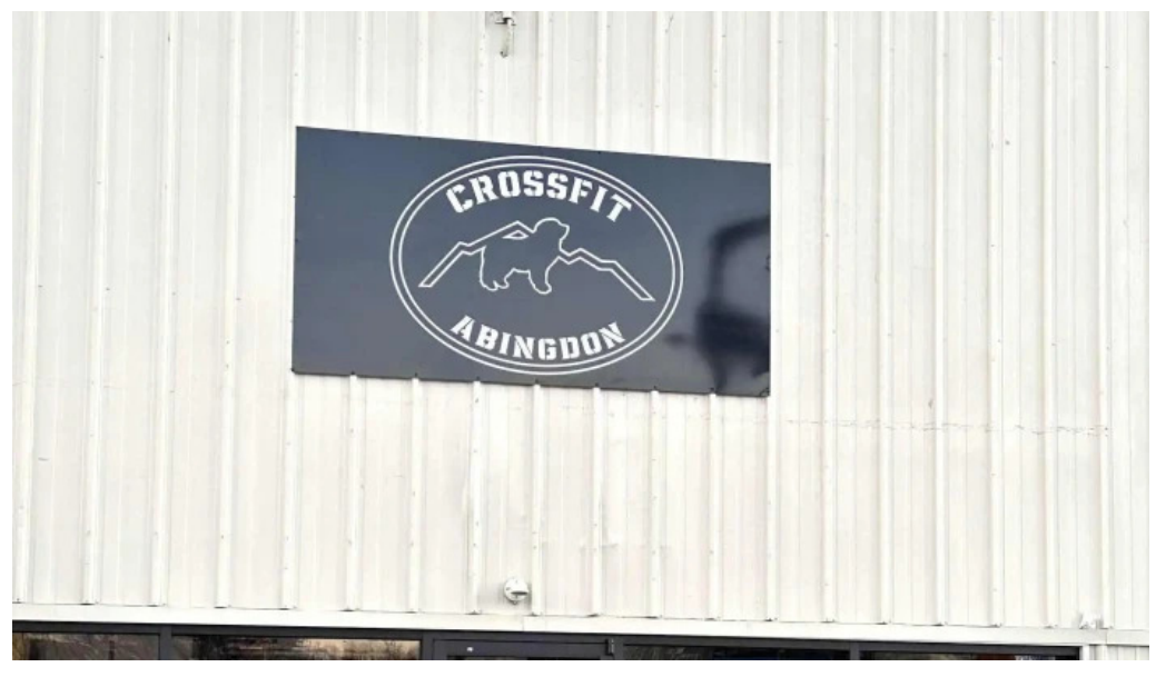
Crossfit abingdon abingdon