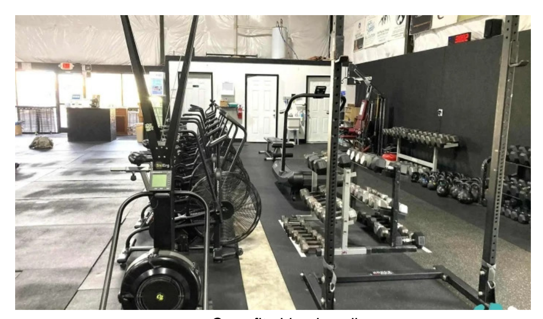
Crossfit abingdon all