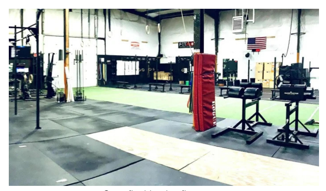
Crossfit abingdon fitness center