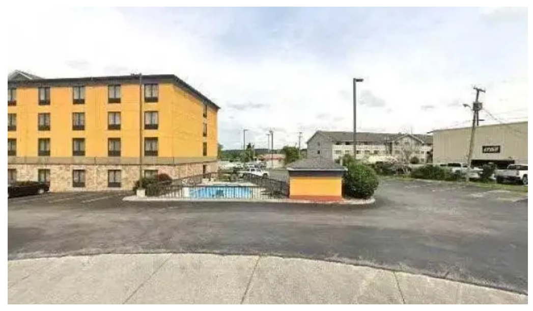
Crossfit abingdon street view 360deg