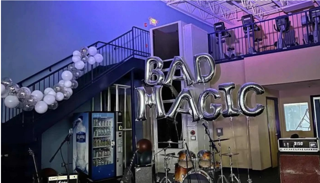
Northeast health fitness all