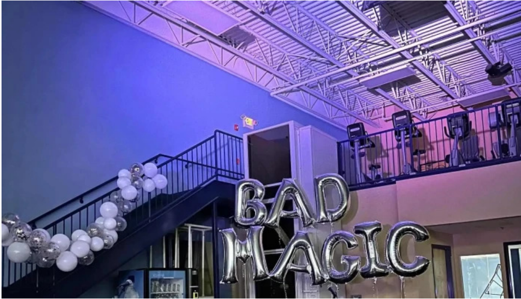
Northeast health fitness number