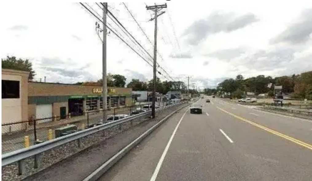
Northeast health fitness street view 360deg