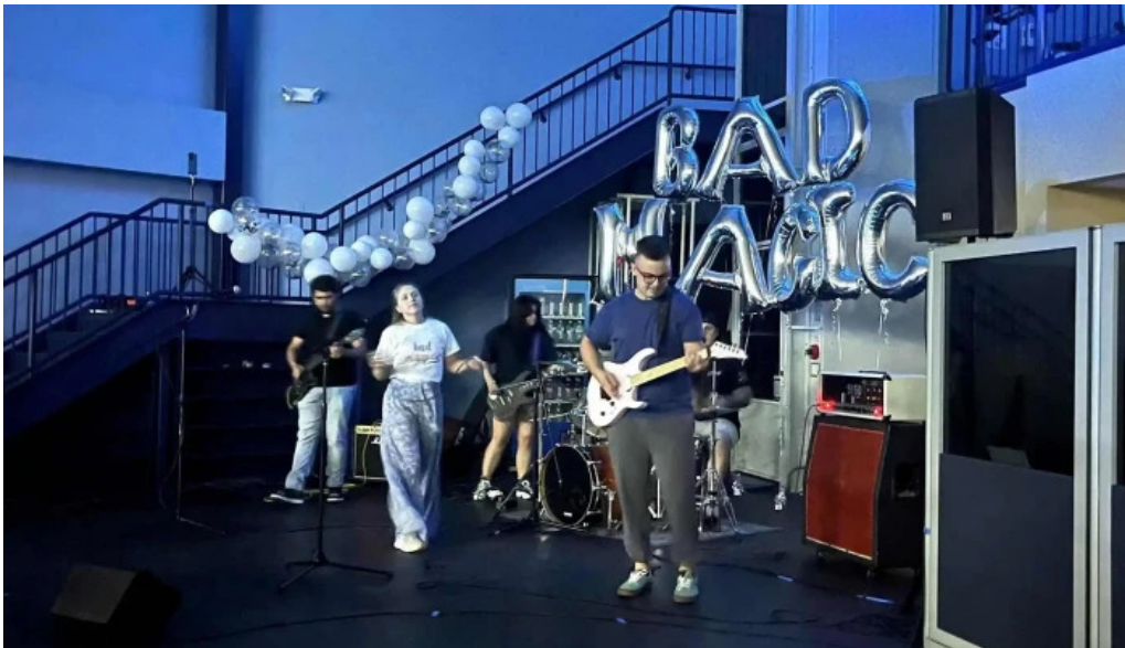
Northeast health fitness abington