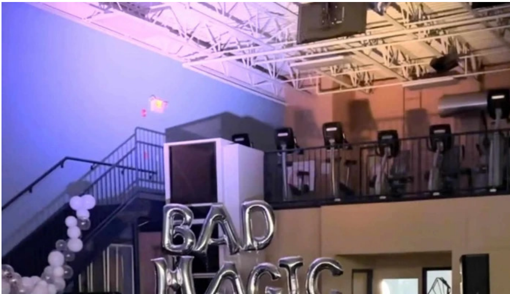
Northeast health fitness fitness center