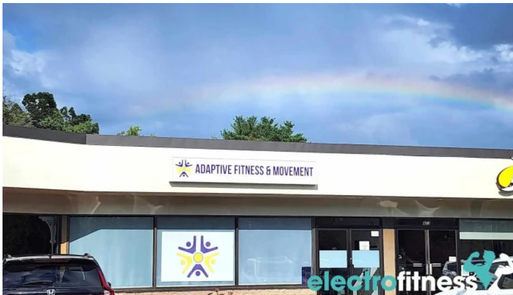
Adaptive fitness movement acton