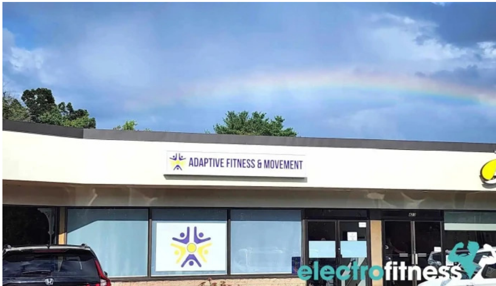
Adaptive fitness movement all