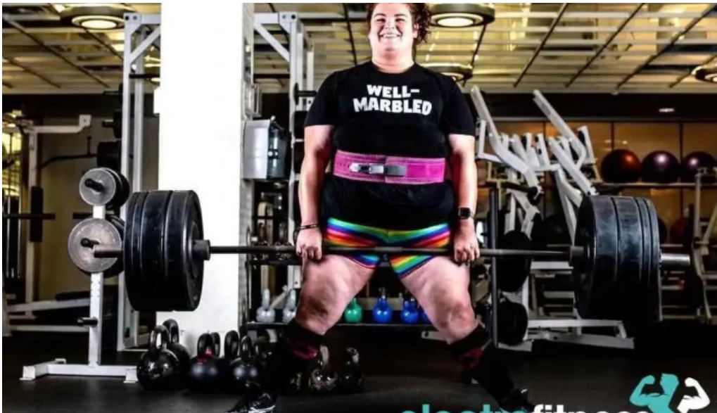
Prettystrong strength training acworth