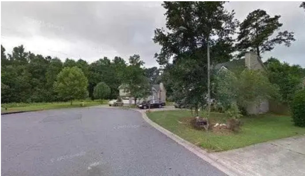
Prettystrong strength training street view 360deg