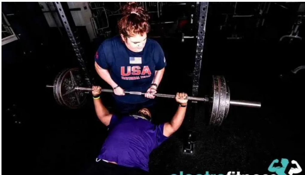
Prettystrong strength training gym