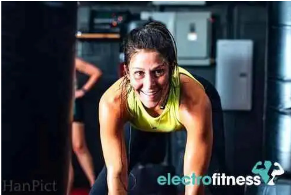
Conquer kickboxing gym