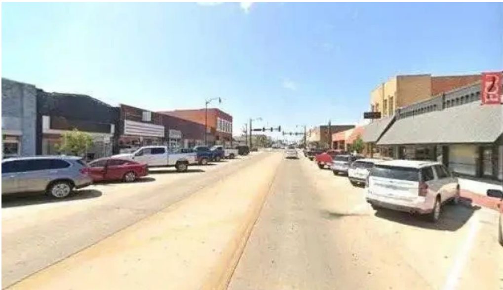
Conquer kickboxing street view 360deg