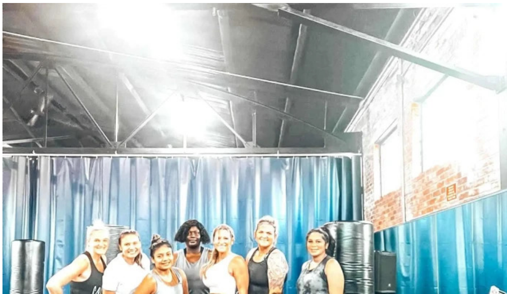
Conquer kickboxing fitness center