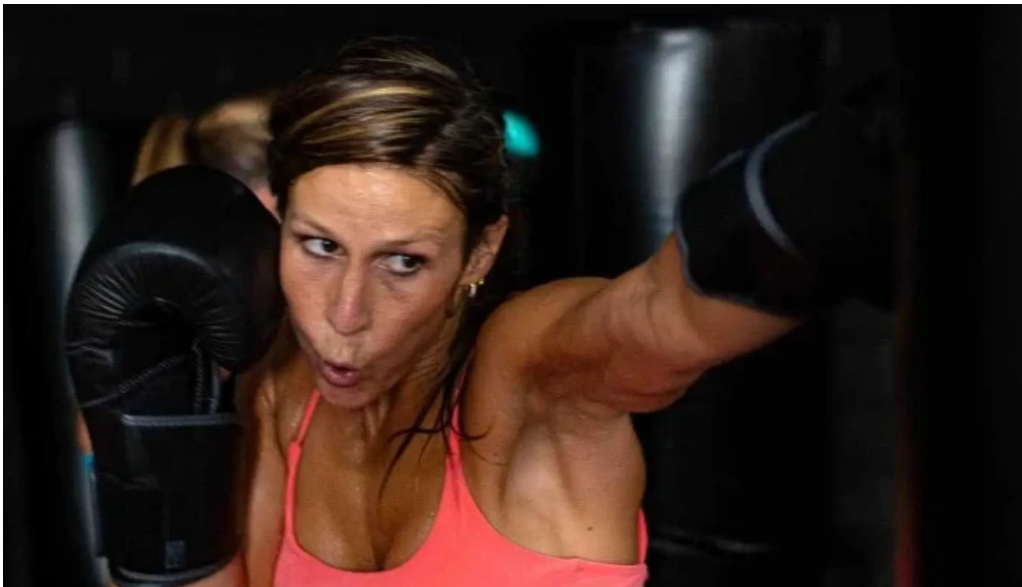
Conquer kickboxing all