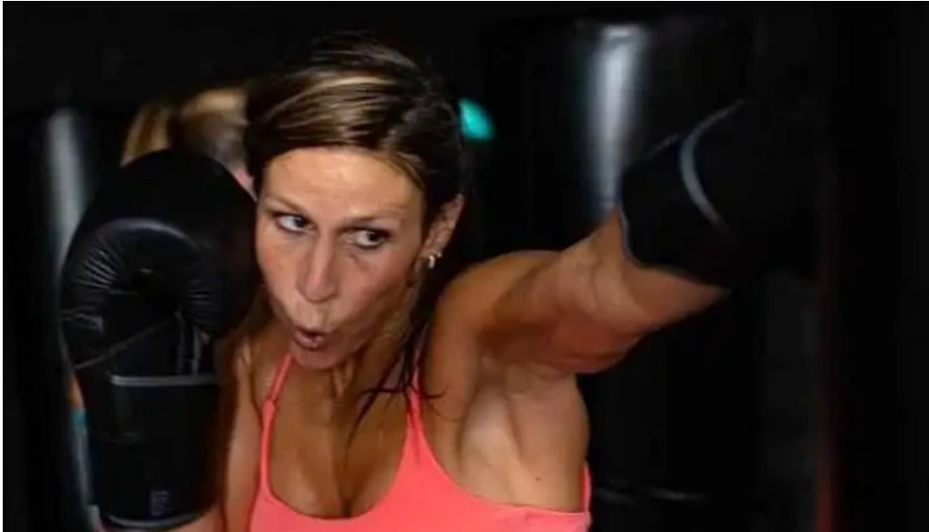
Conquer kickboxing ada