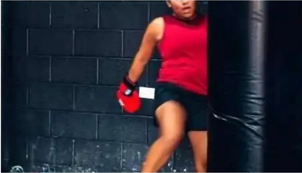
Conquer kickboxing by owner