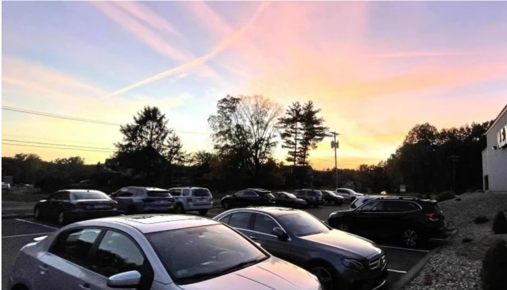
Next fitness fitness center