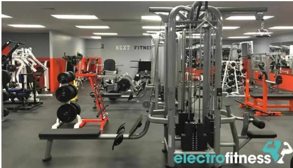
Next fitness all