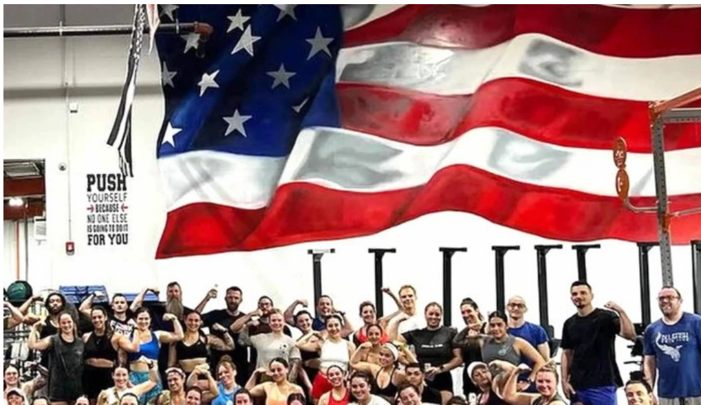
Next fitness agawam