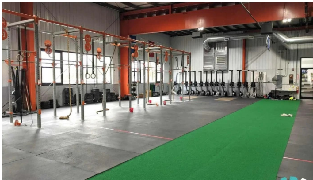
Next fitness gym