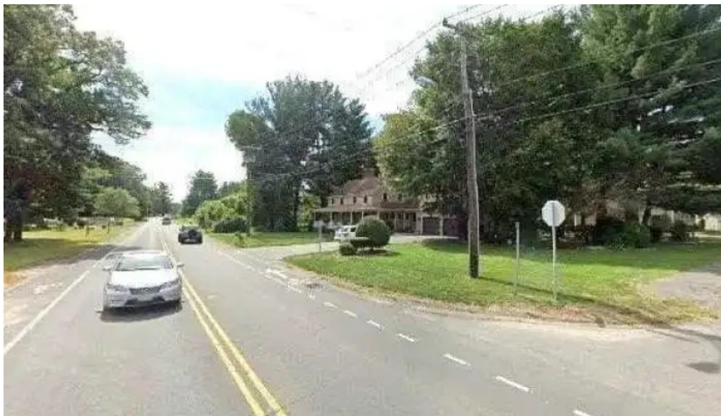
Next fitness street view 360deg