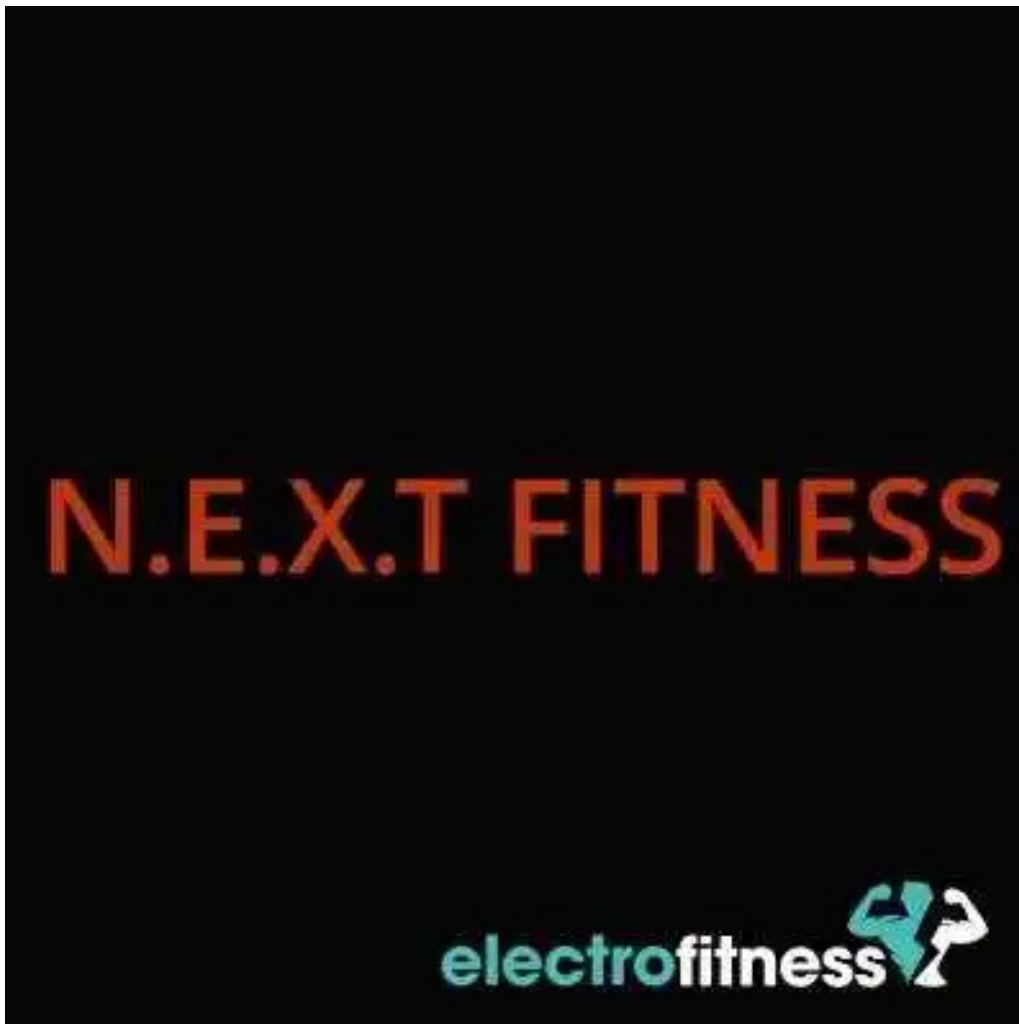
Next fitness by owner