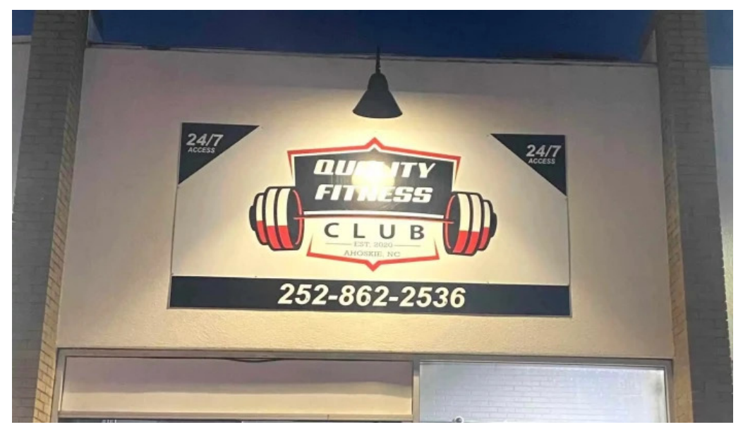
Quality fitness club llc by owner