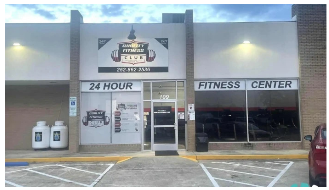
Quality fitness club llc all