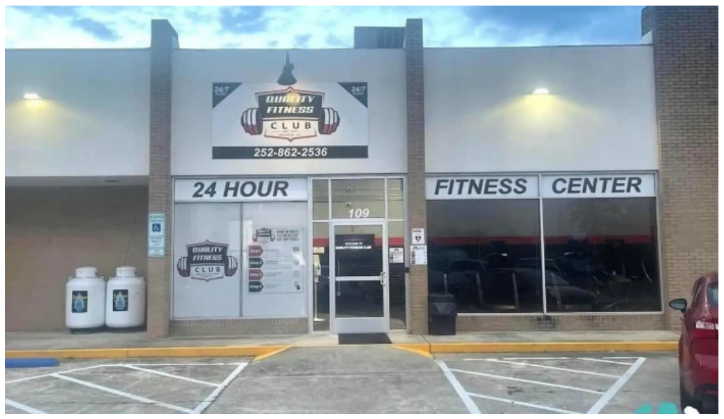
Quality fitness club llc ahoskie