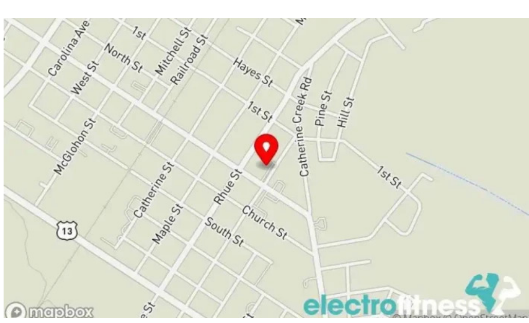
Quality fitness club llc map