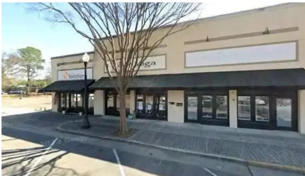
Kenny ray personal training all