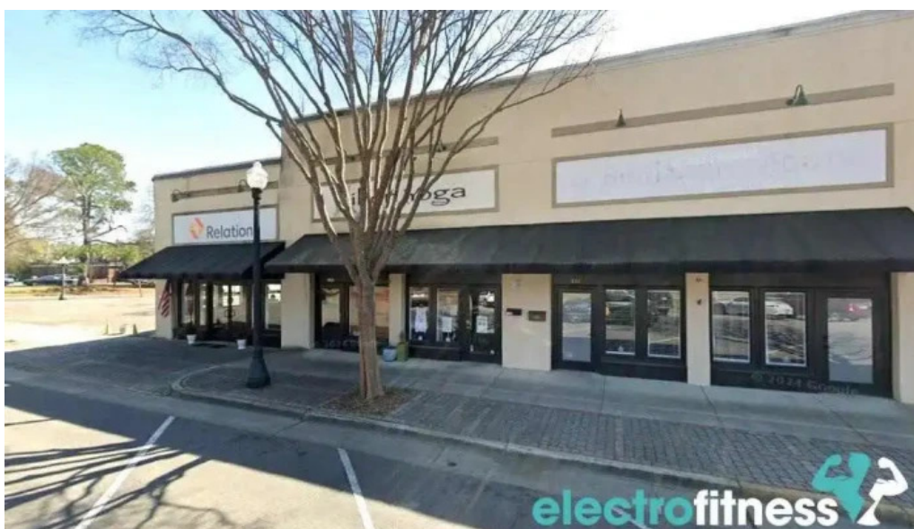
Kenny ray personal training aiken