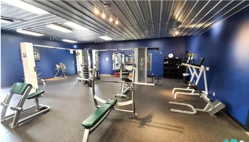
Priority fitness all