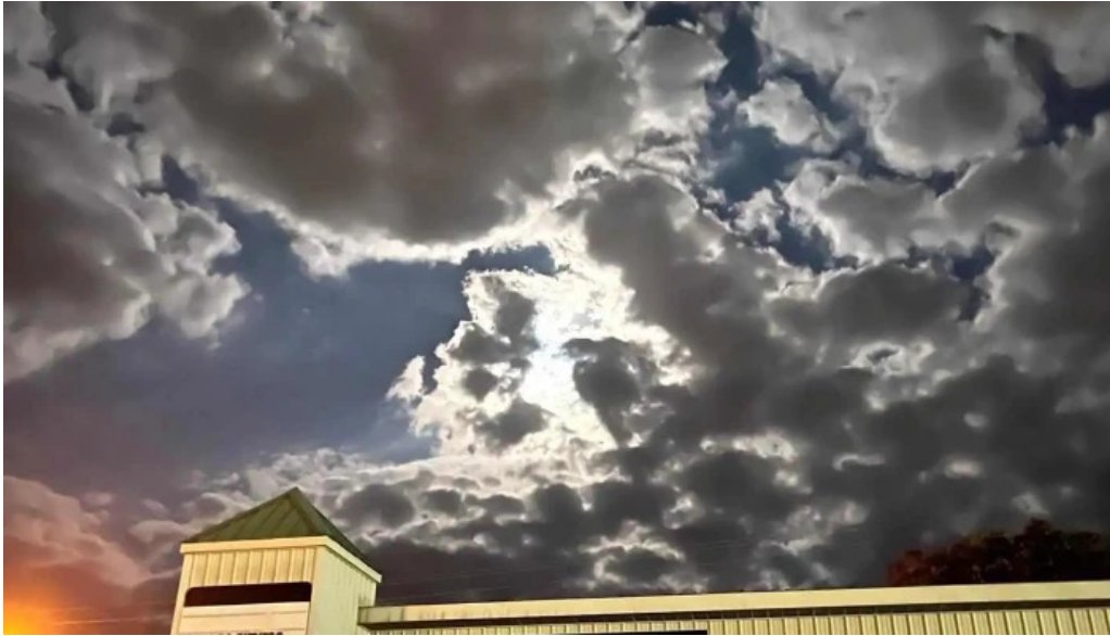
Priority fitness latest