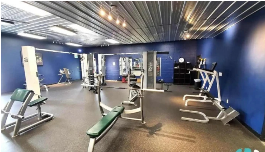
Priority fitness bedford