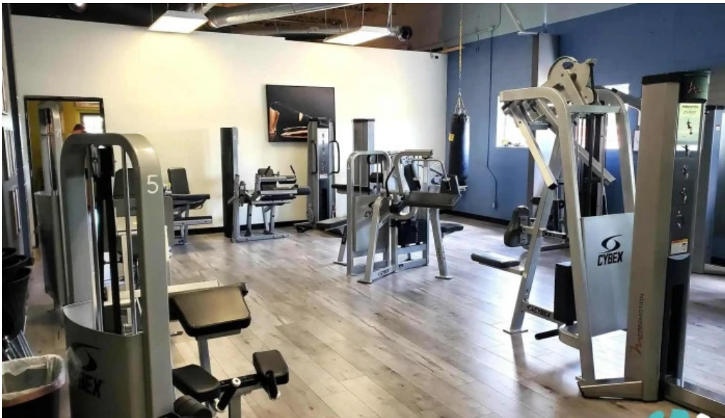
Priority fitness by owner