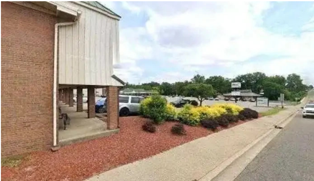
Priority fitness street view 360