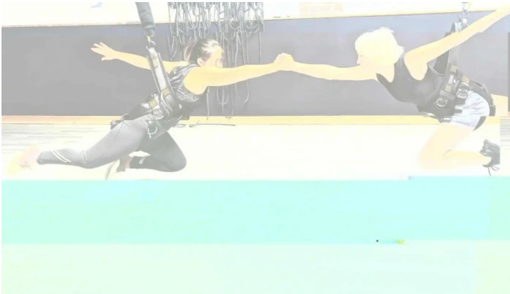
Lift me up bungee fitness berkeley