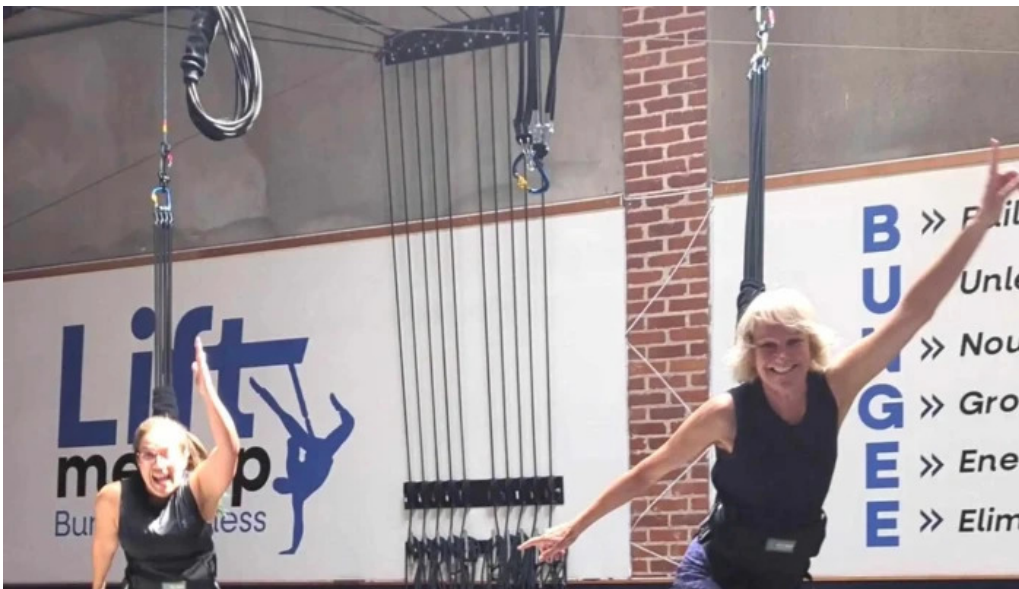
Lift me up bungee fitness phone