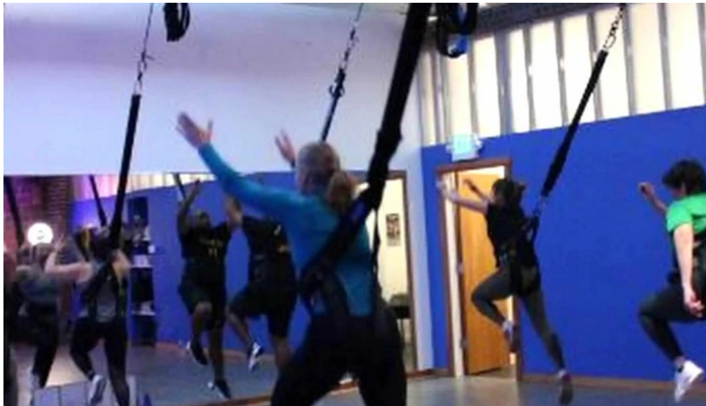
Lift me up bungee fitness fitness center