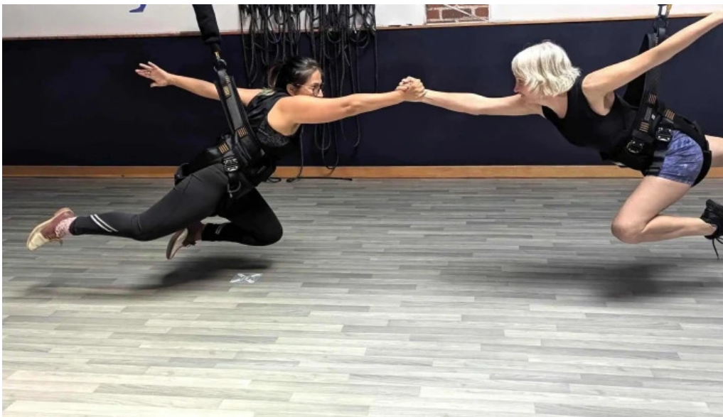
Lift me up bungee fitness videos