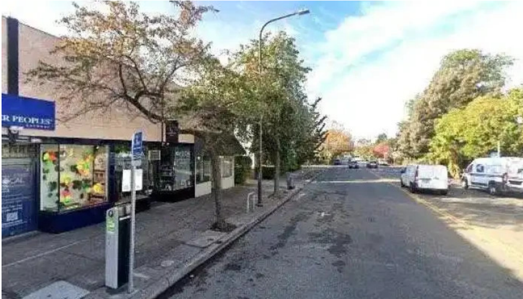
Lift me up bungee fitness street view 360deg