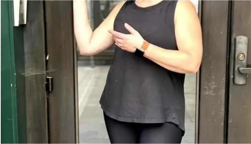
Lift me up bungee fitness by owner