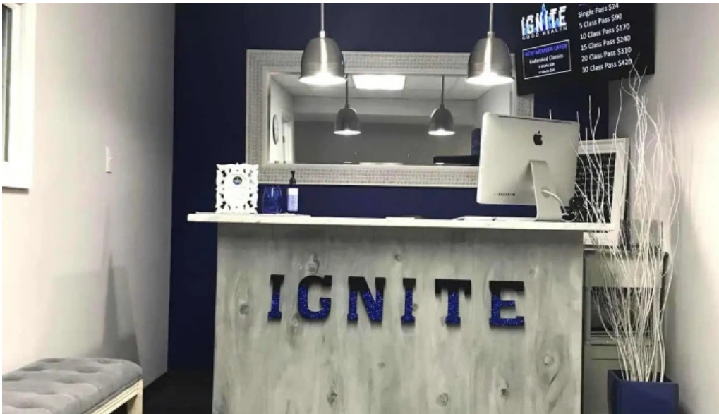
Ignite good health by owner