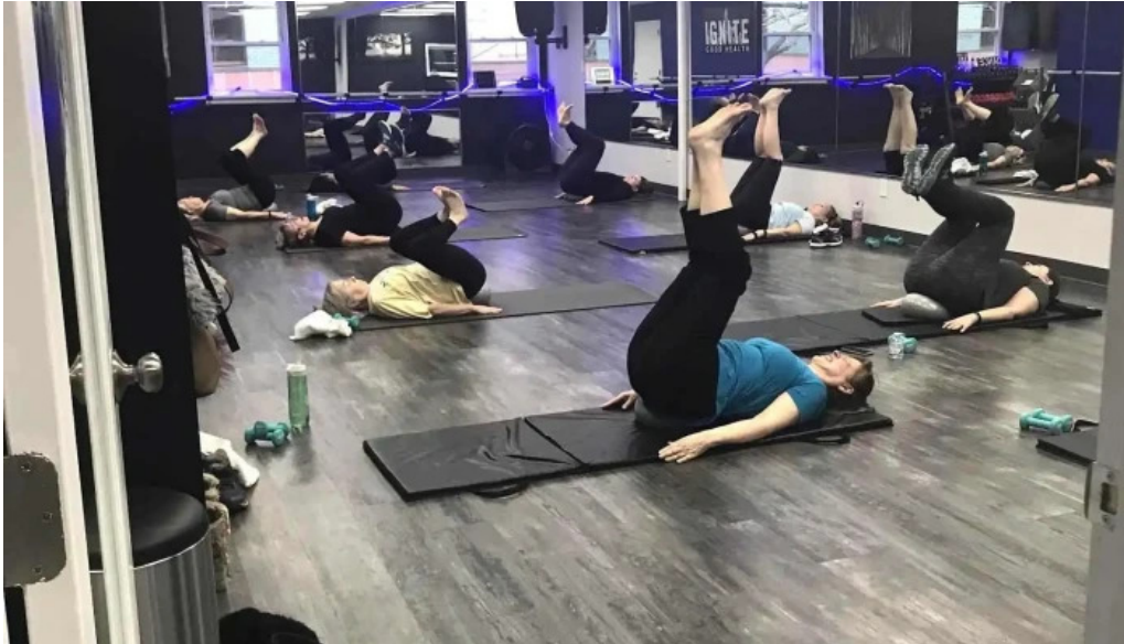
Ignite good health gym