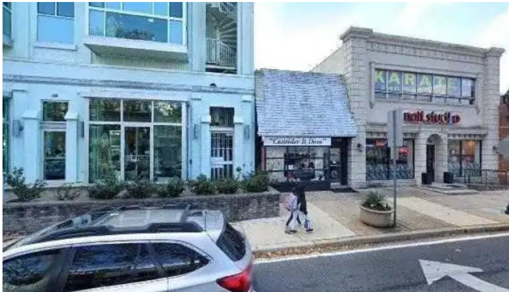
Ignite good health street view 360deg