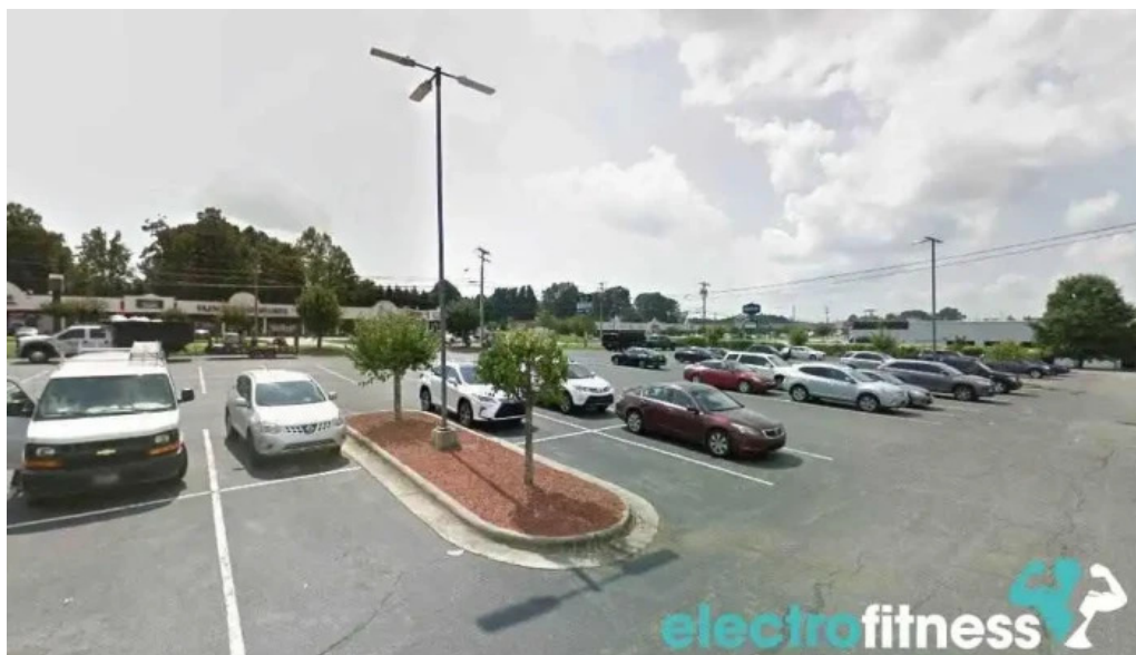
Results driven fitness burlington