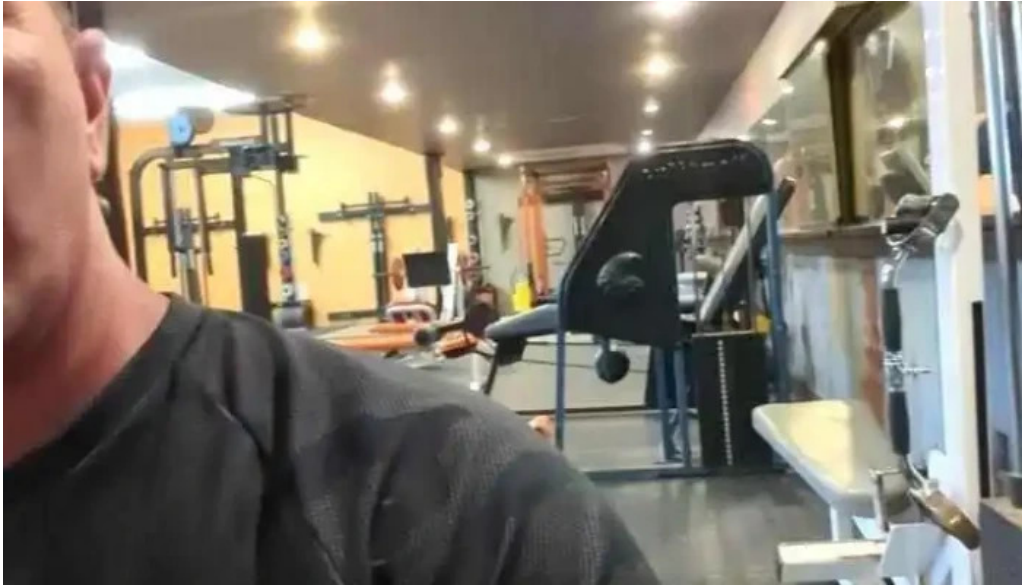
Strong orange gym gym