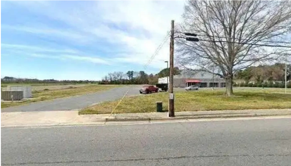
Strong orange gym street view 360deg