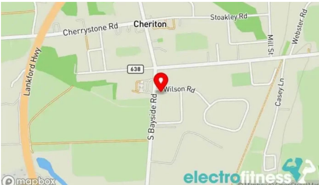
Strong orange gym map