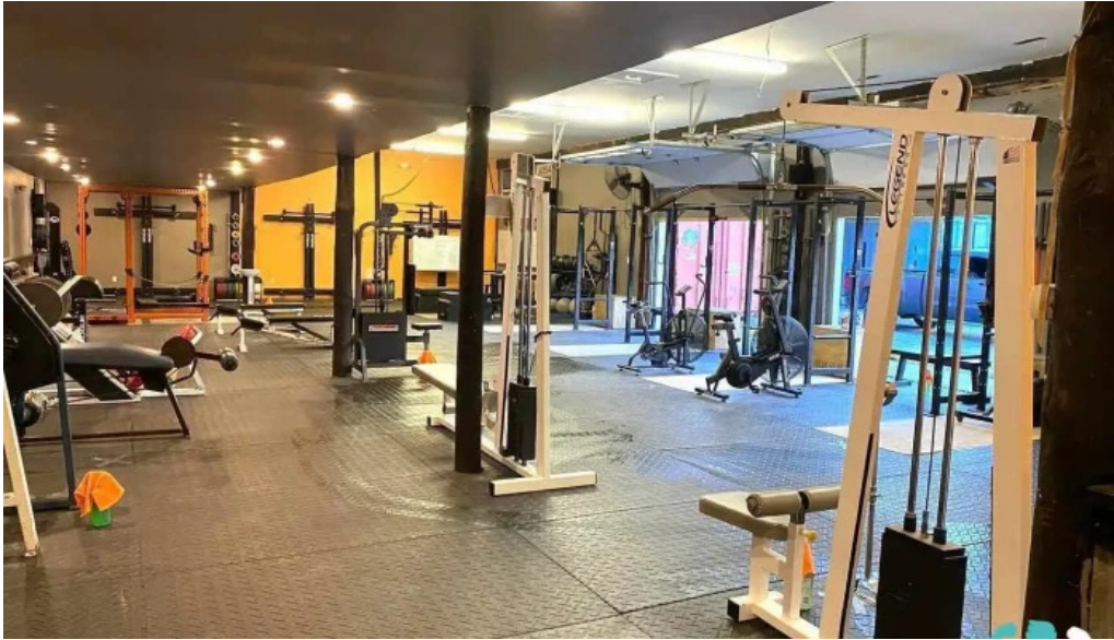
Strong orange gym cape charles