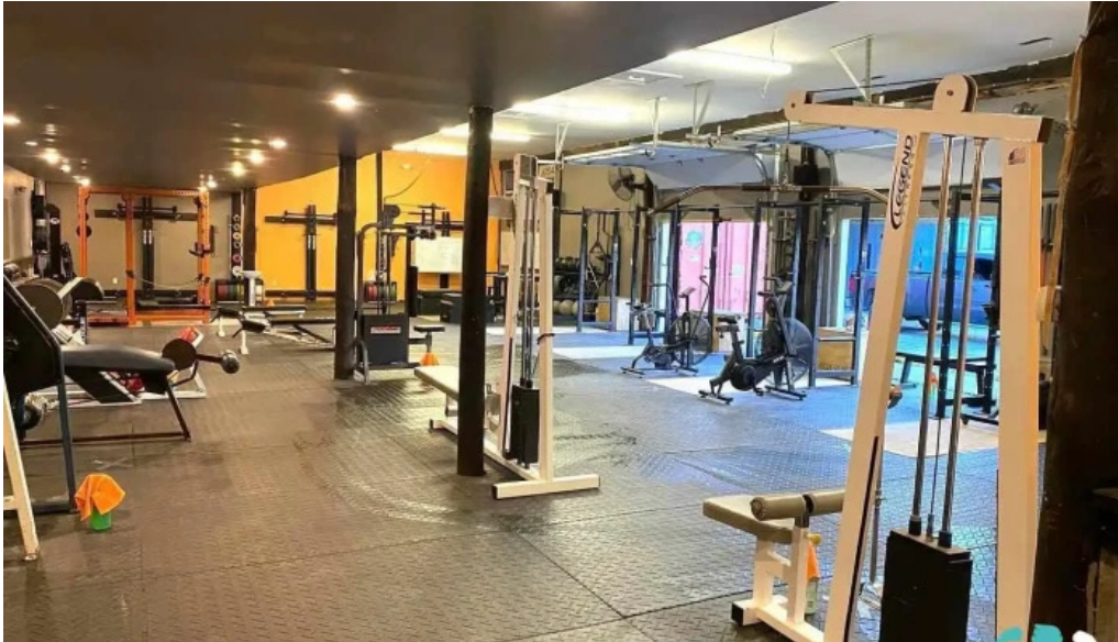
Strong orange gym all