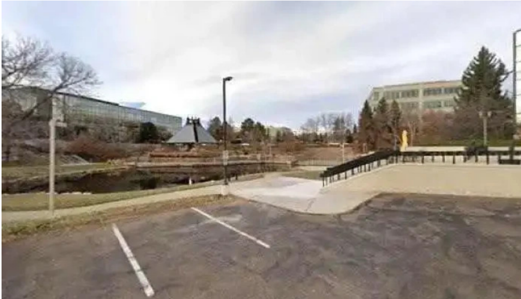
Factum performance and wellness all