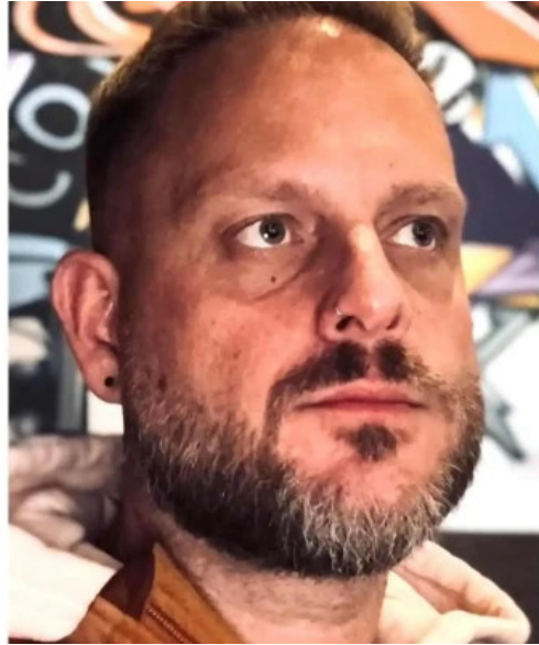
Factum performance and wellness fitness center