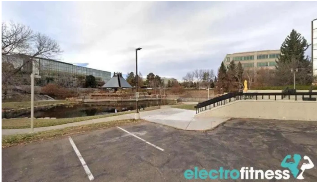
Factum performance and wellness centennial