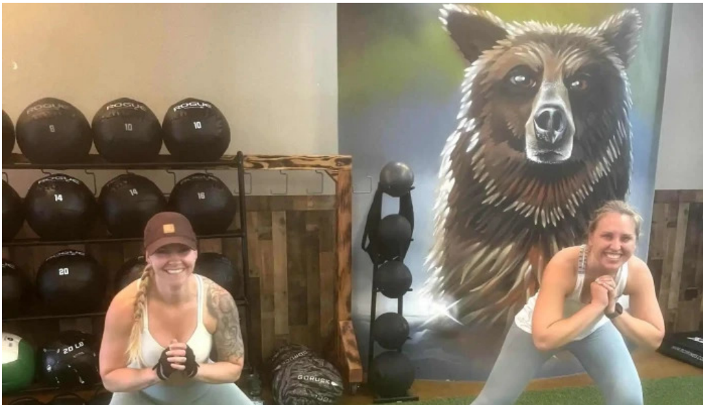
Rocky mountain strength number