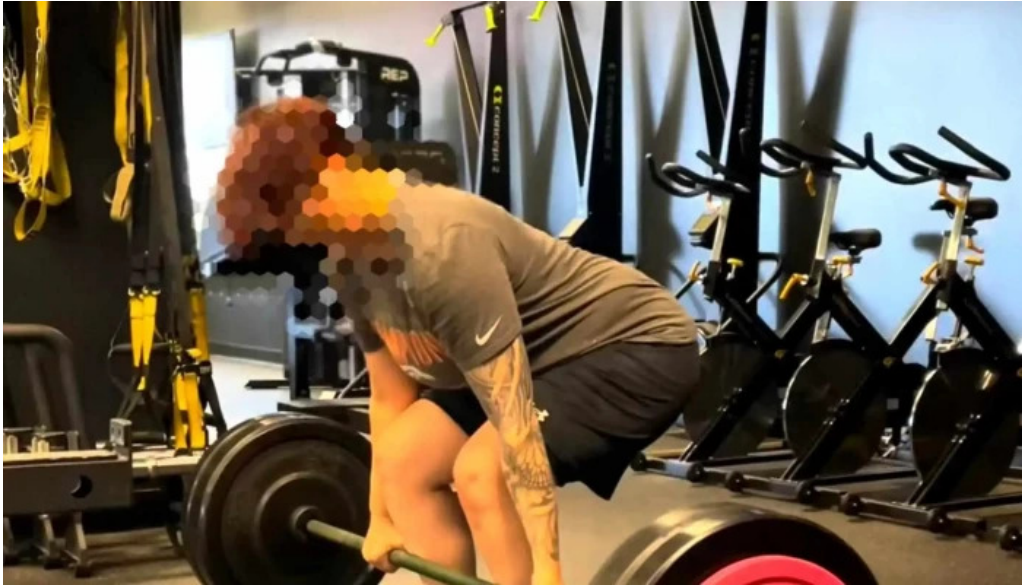
Rocky mountain strength centennial