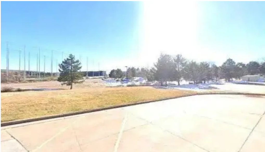
Rocky mountain strength street view 360deg