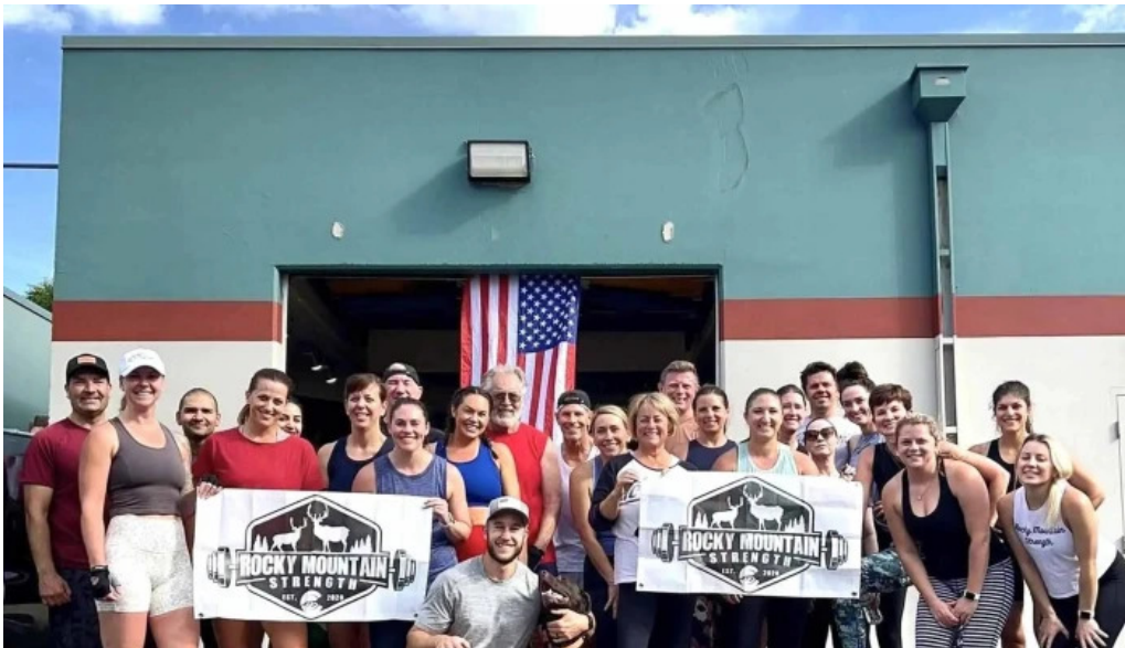
Rocky mountain strength instagram