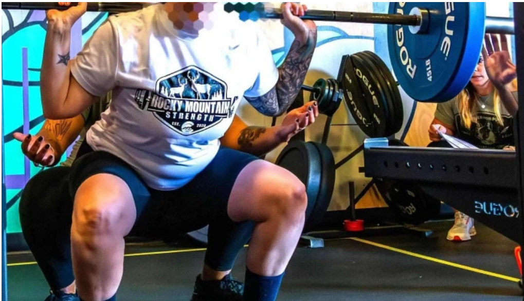
Rocky mountain strength videos