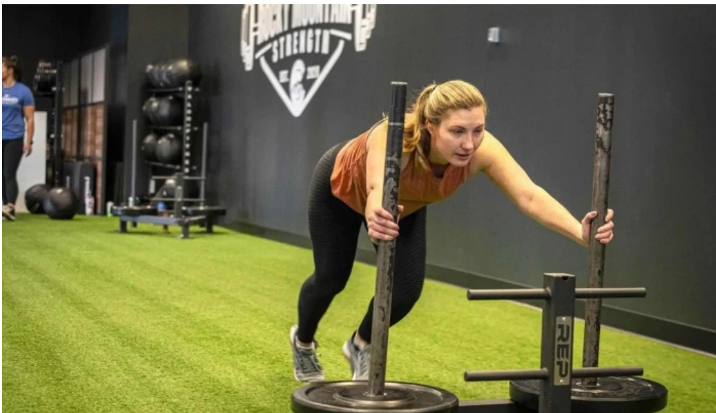
Rocky mountain strength gym