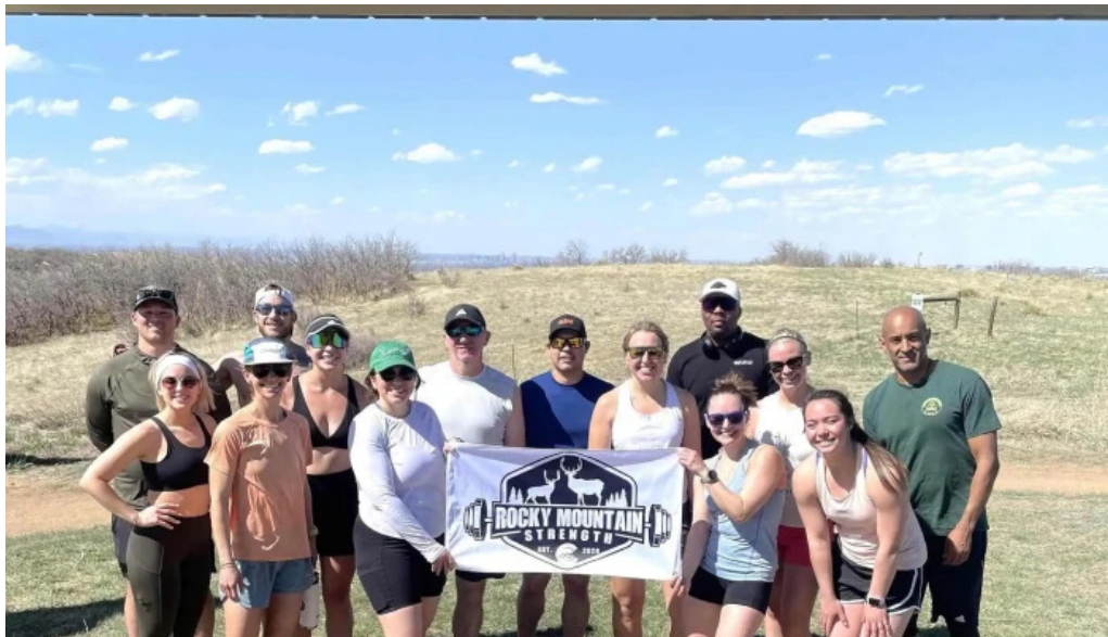
Rocky mountain strength location