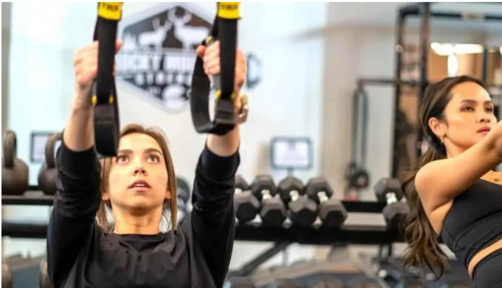
Rocky mountain strength by owner