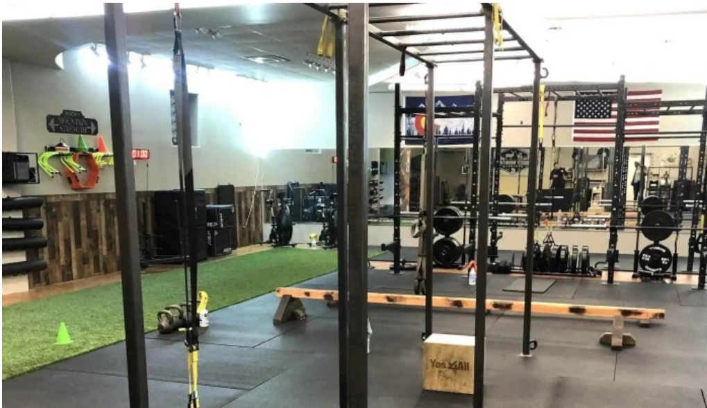
Rocky mountain strength discounts