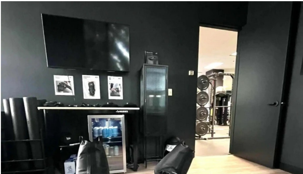
Rocky mountain strength phone