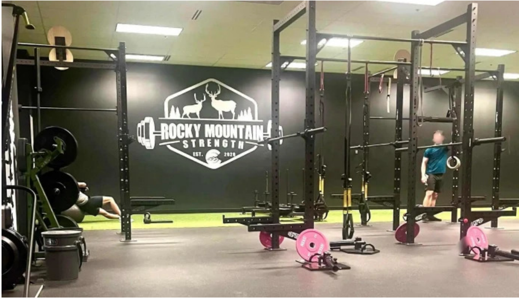
Rocky mountain strength fitness center