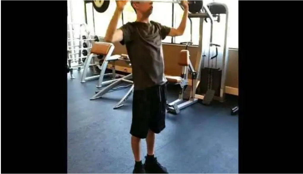
True living fitness llc videos