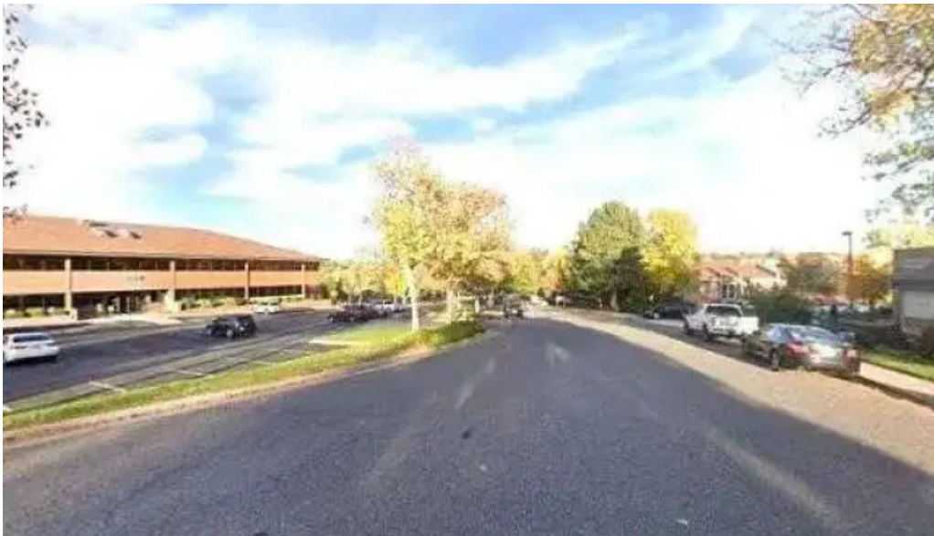
True living fitness llc street view 360deg