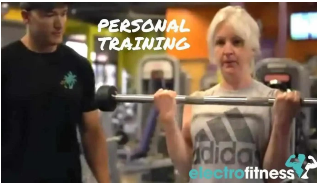
True living fitness llc all