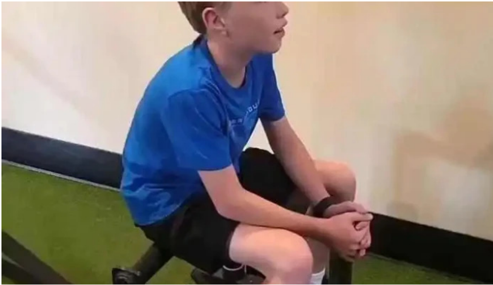
True living fitness llc by owner