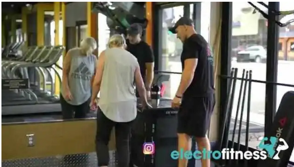
True living fitness llc gym