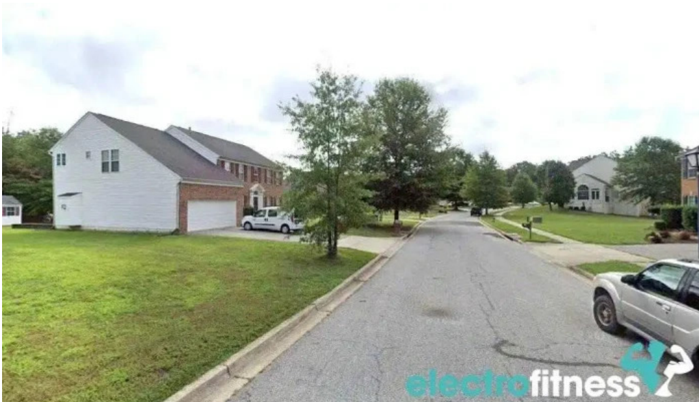
Better body fitness clinton