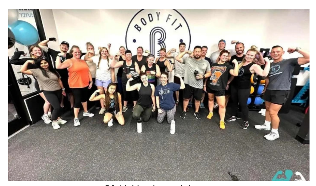
Bft highlands ranch by owner