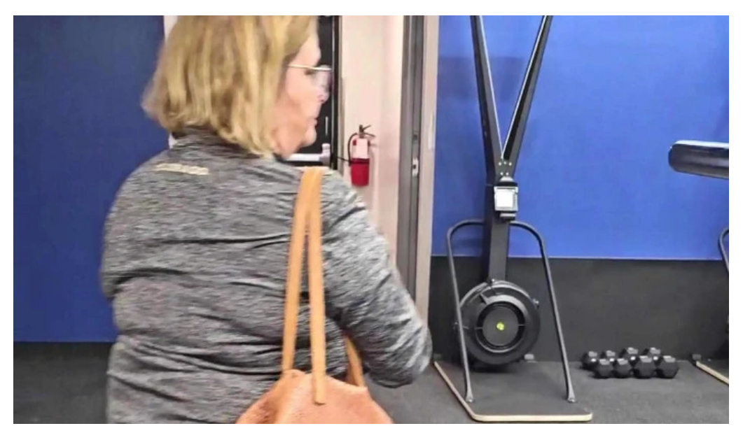
Bft highlands ranch phone