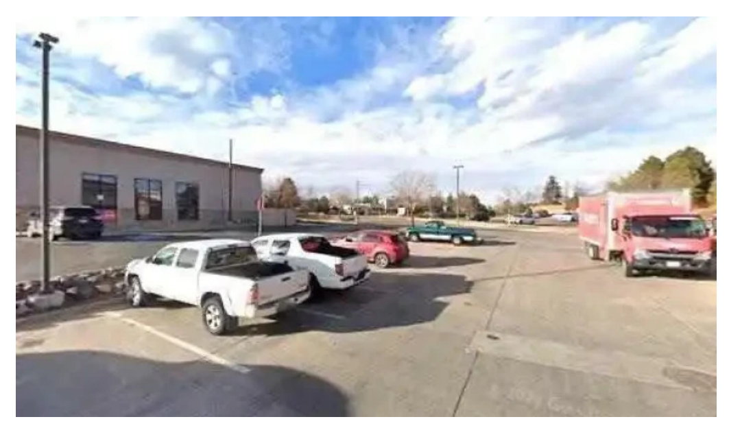
Bft highlands ranch street view 360deg