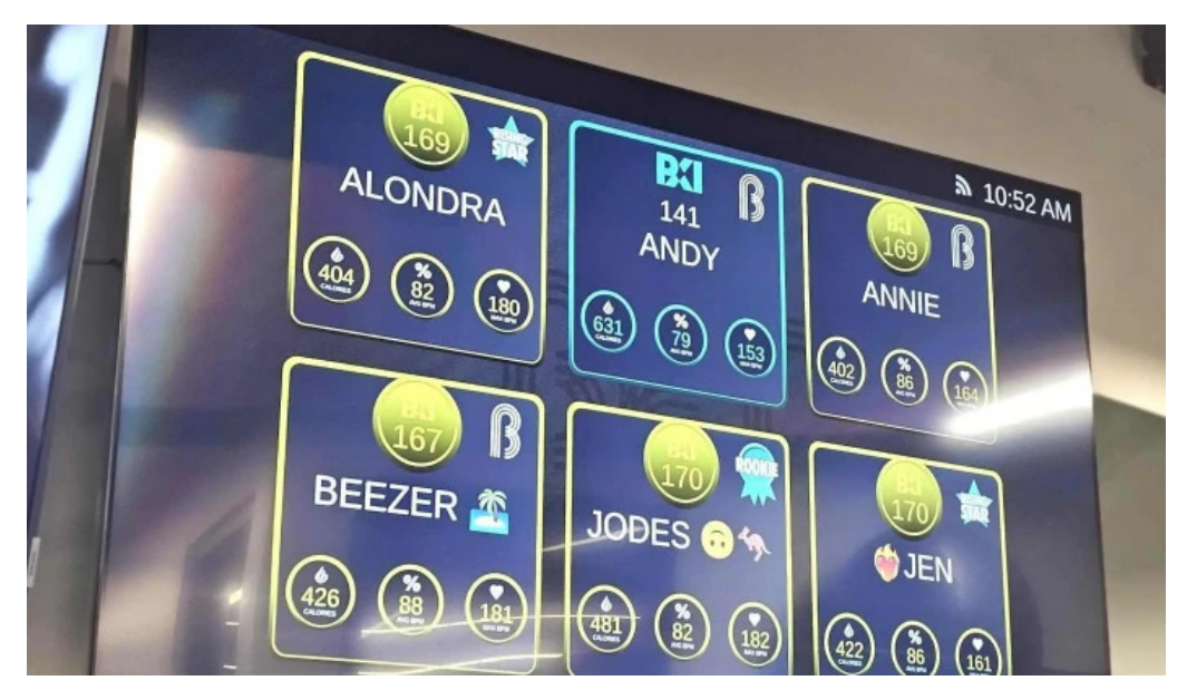
Bft highlands ranch fitness center