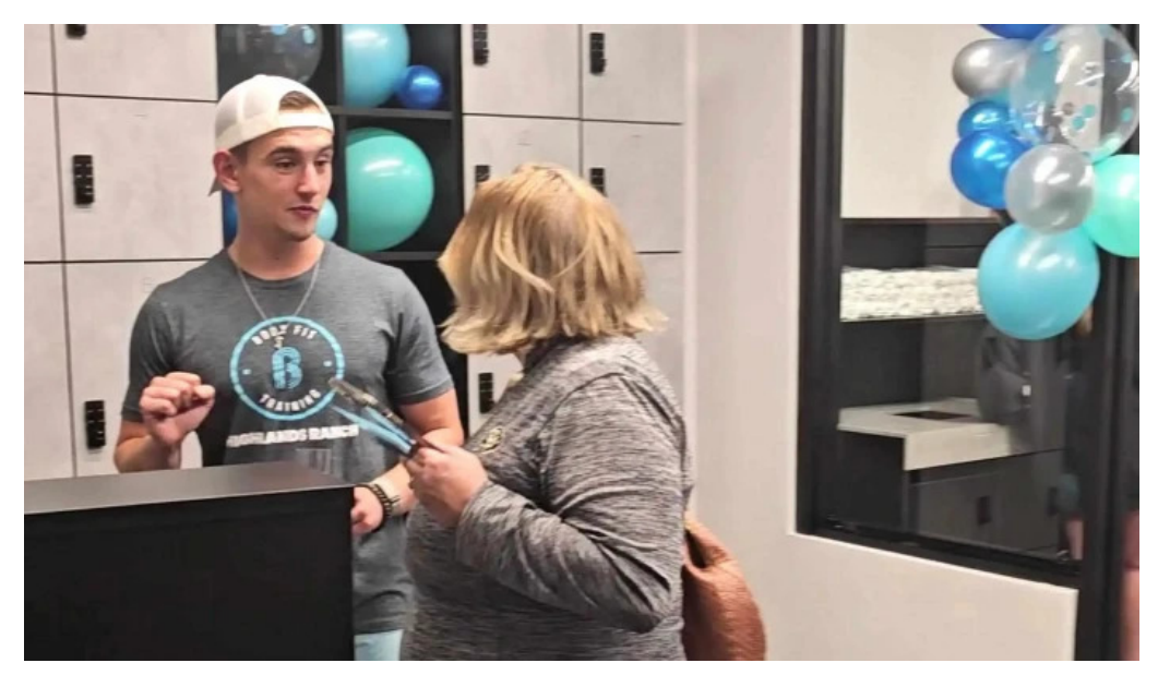
Bft highlands ranch highlands ranch