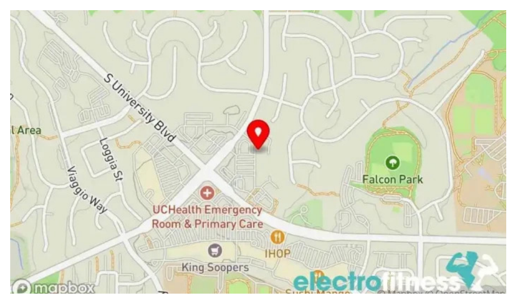
Bft highlands ranch map