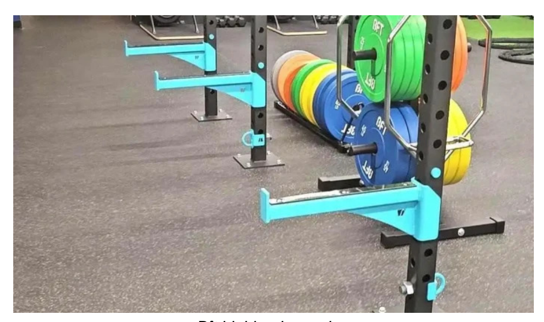
Bft highlands ranch gym