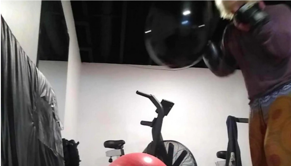
Sweat shop fitness discounts