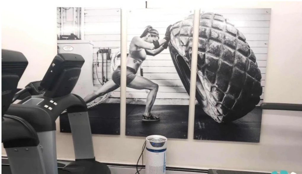
Sweat shop fitness gym