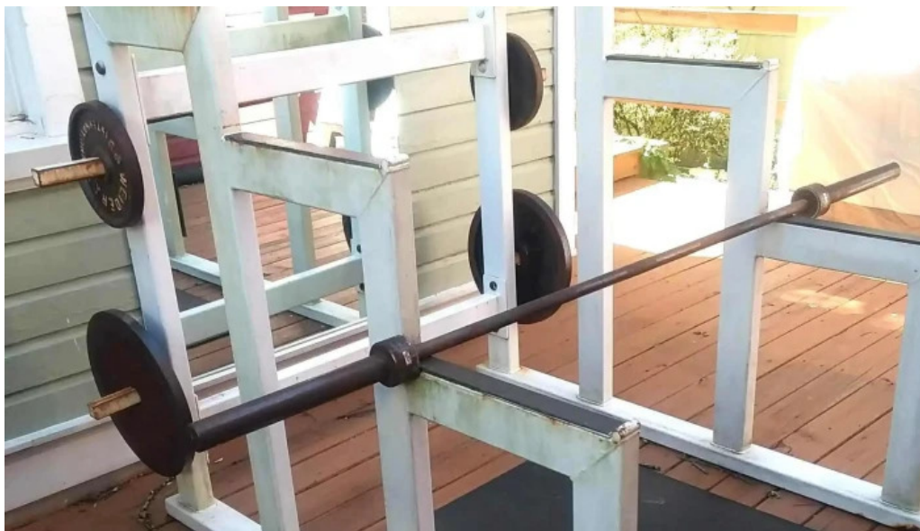
Sweat shop fitness kensington