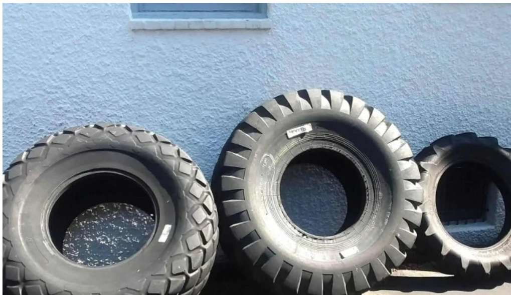
Sweat shop fitness fitness center