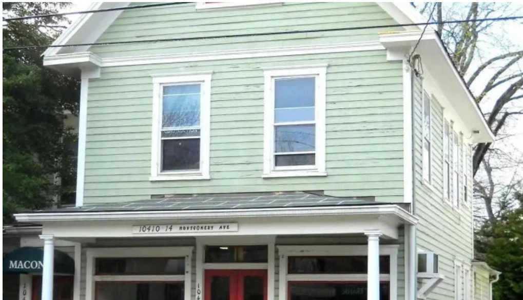
Sweat shop fitness all