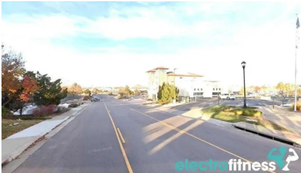
Performance ready fitness studio lone tree