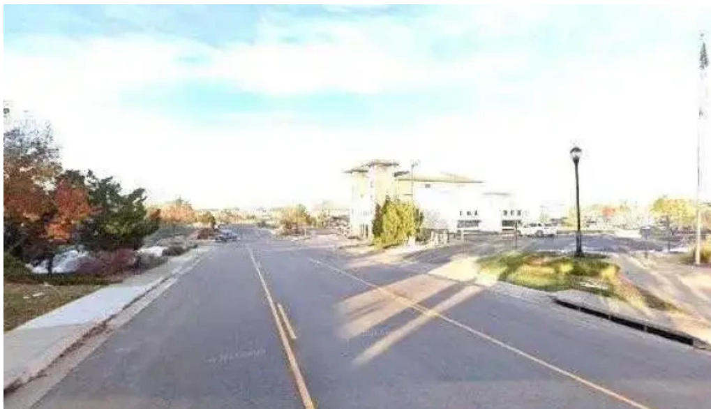
Performance ready fitness studio all