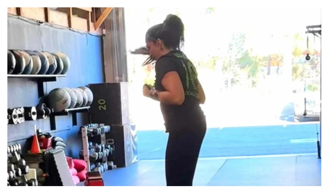
Martinez elite fitness fitness center