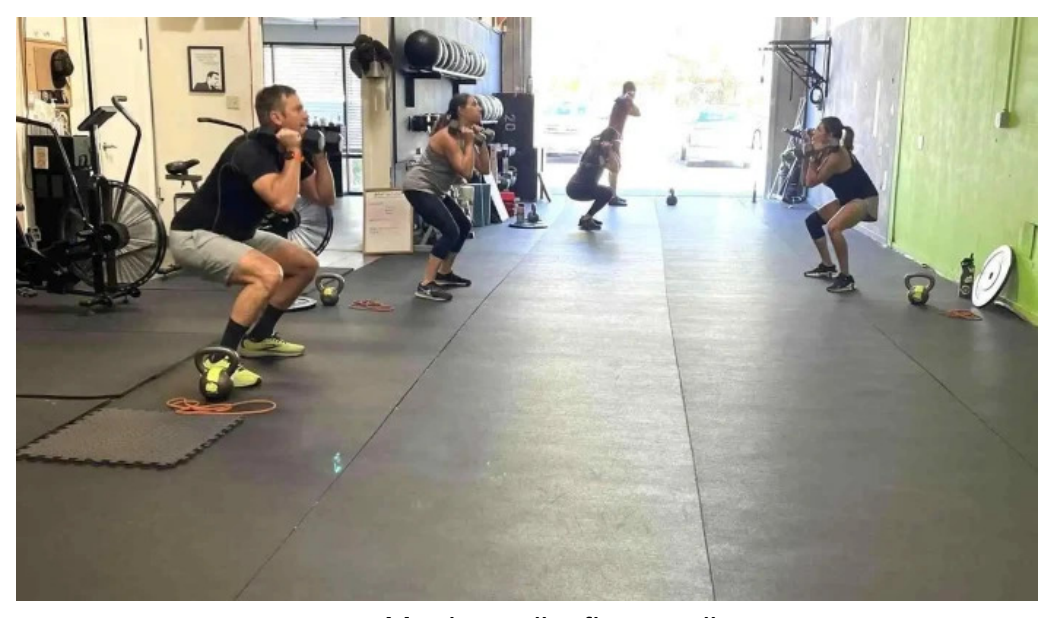
Martinez elite fitness all