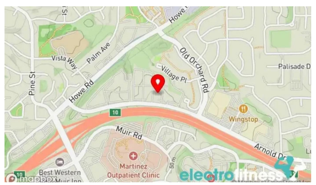
Martinez elite fitness map