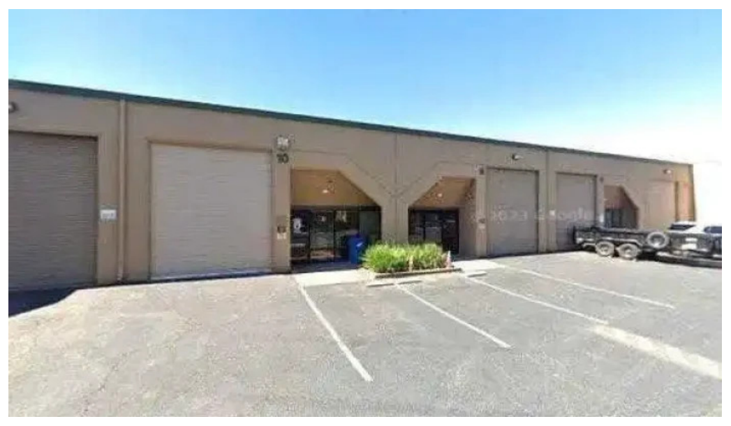
Martinez elite fitness street view 360deg