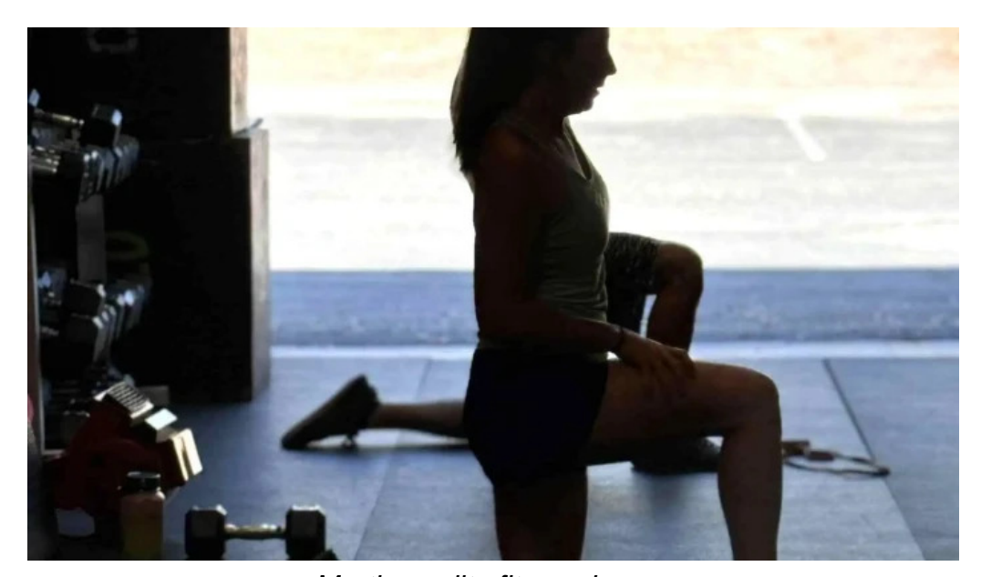
Martinez elite fitness by owner