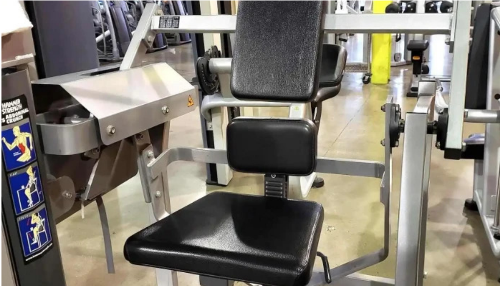
Charter fitness of merrillville in gym