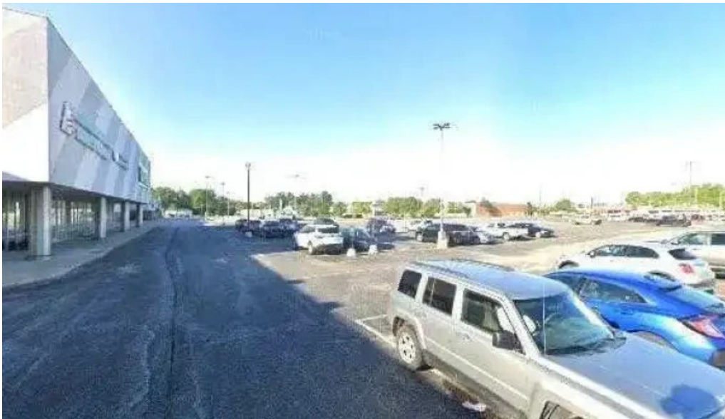
Charter fitness of merrillville in street view 360