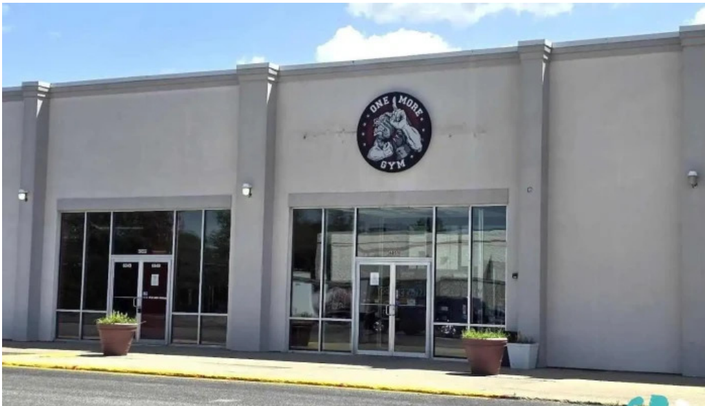
Charter fitness of merrillville in merrillville