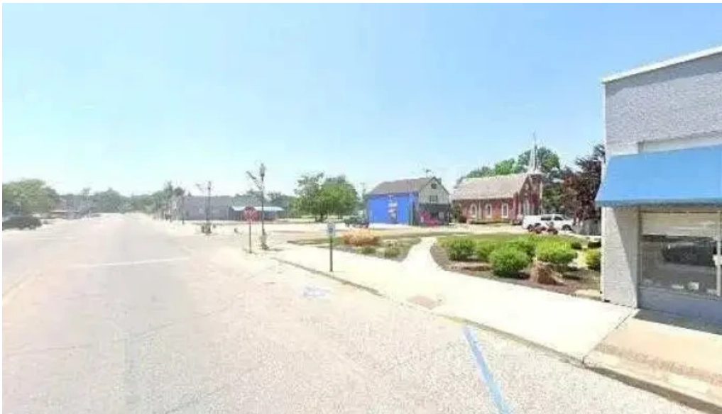
Priority fitness mitchell street view 360