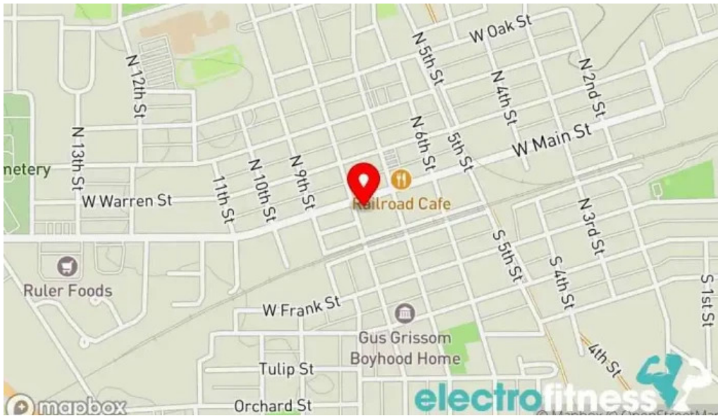
Priority fitness mitchell map