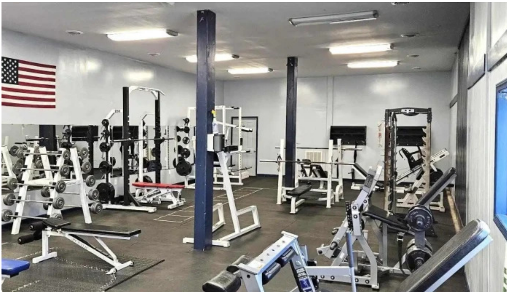
Priority fitness mitchell all