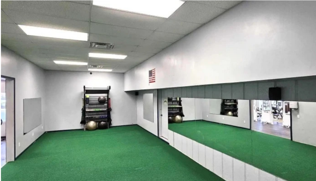
Priority fitness mitchell by owner