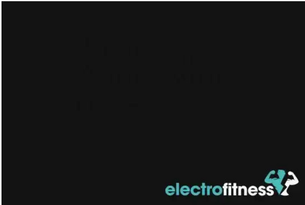
Gail grandchamp personal training fitness boxing self defense studio by owner