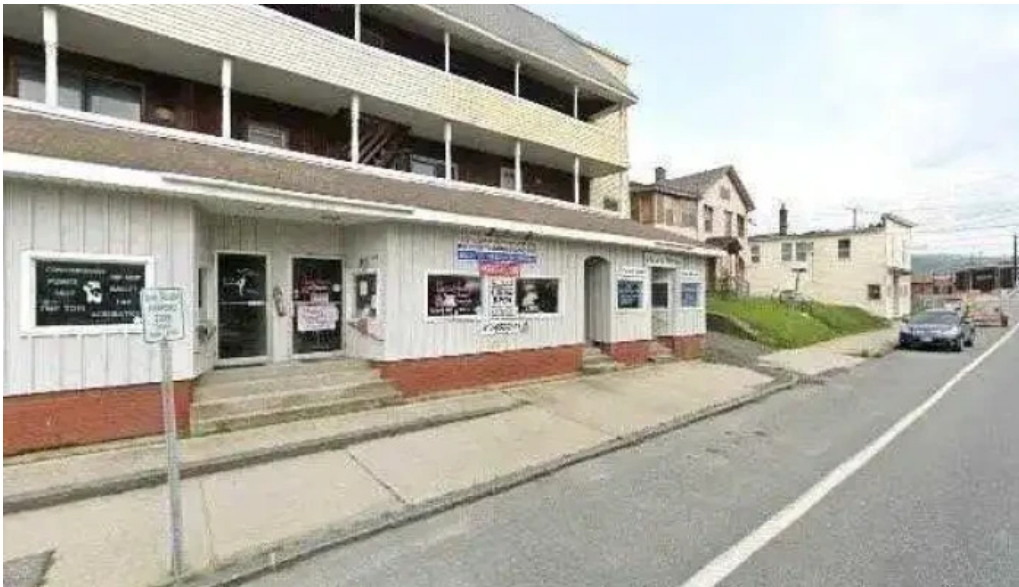
Gail grandchamp personal training fitness boxing self defense studio street view 360deg