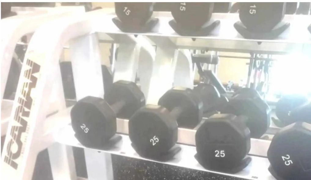
Healthtrax fitness wellness fitness center