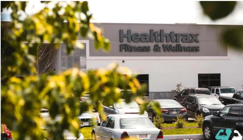
Healthtrax fitness wellness by owner