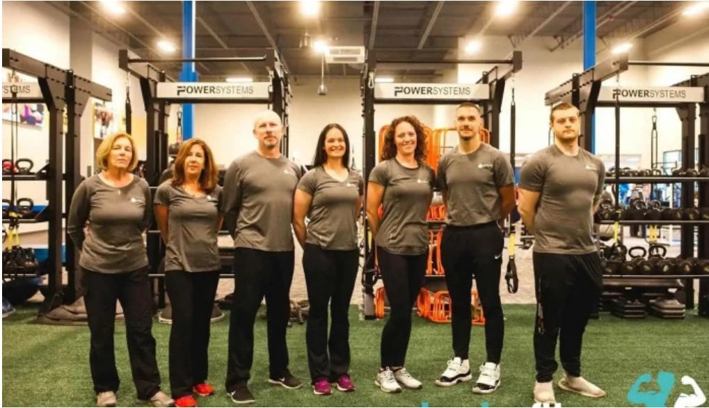
Healthtrax fitness wellness north dartmouth