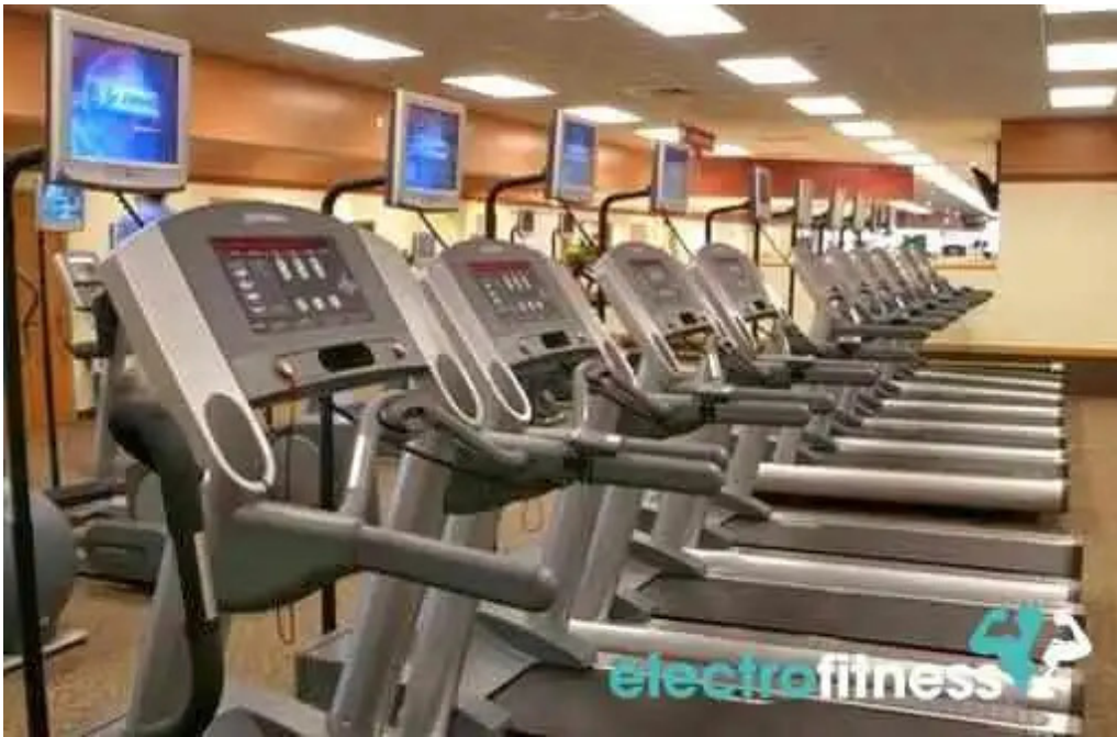
Healthtrax fitness wellness gym