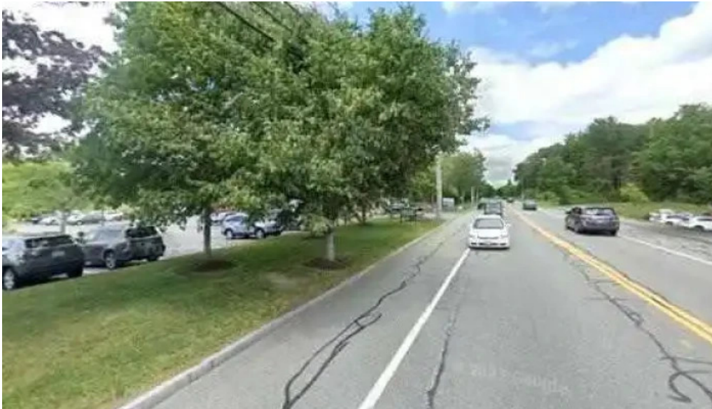
Healthtrax fitness wellness street view 360deg