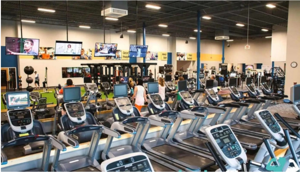
Healthtrax fitness wellness exercise machine