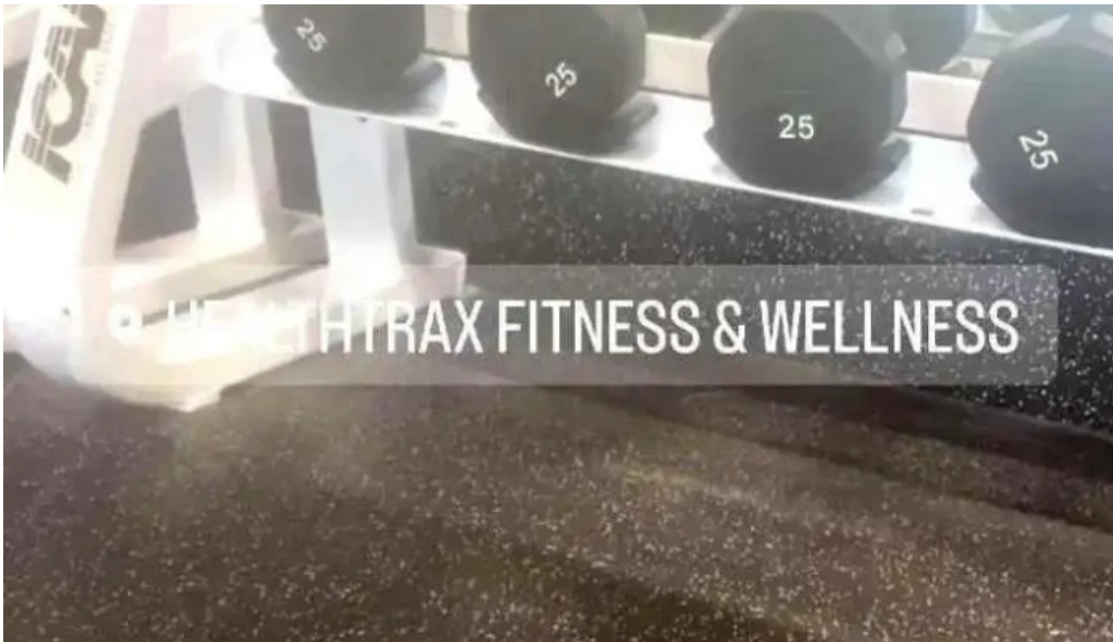
Healthtrax fitness wellness videos