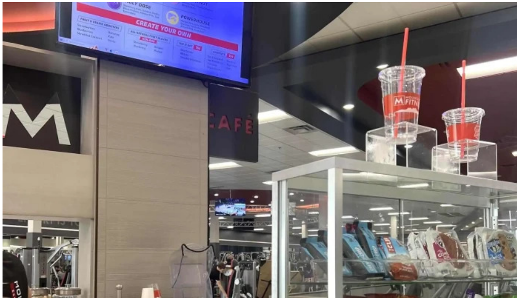
Mountainside fitness ahwatukee prices