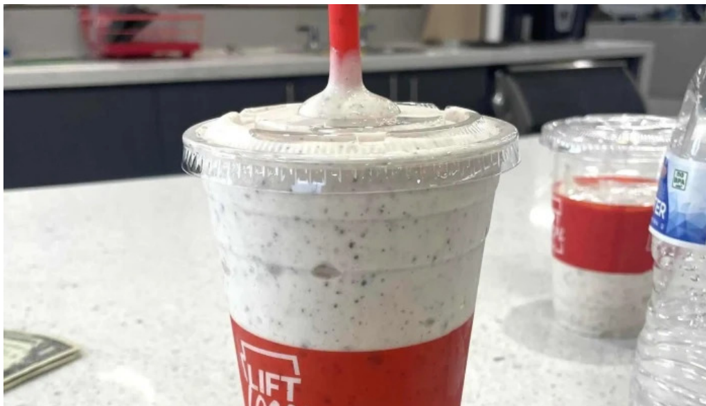
Mountainside fitness ahwatukee photos