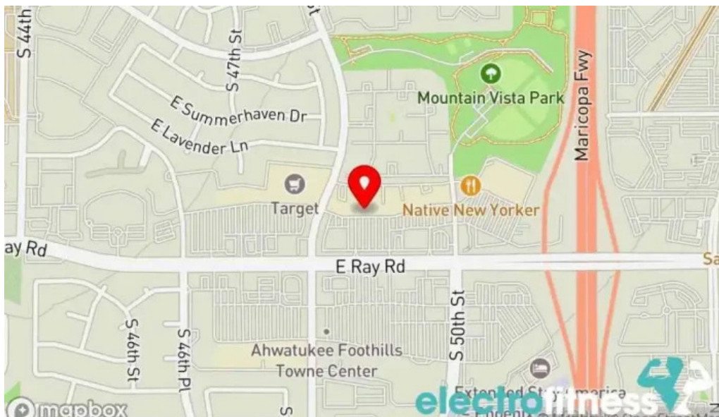
Mountainside fitness ahwatukee map