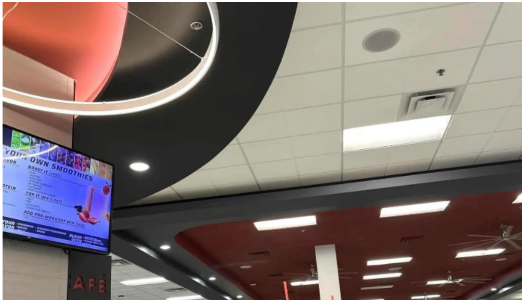
Mountainside fitness ahwatukee phone