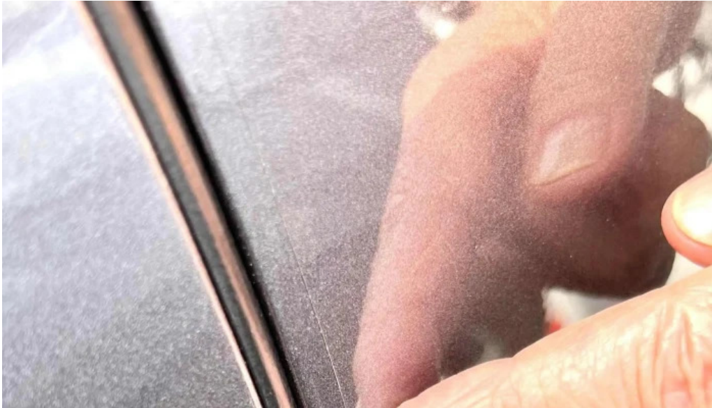
Mountainside fitness ahwatukee near me