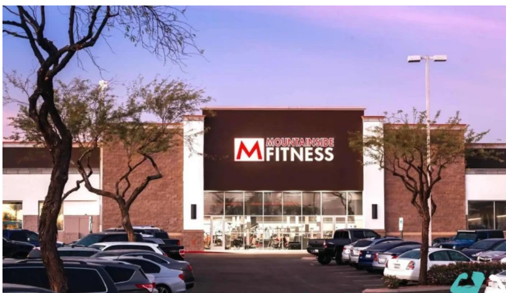
Mountainside fitness ahwatukee all