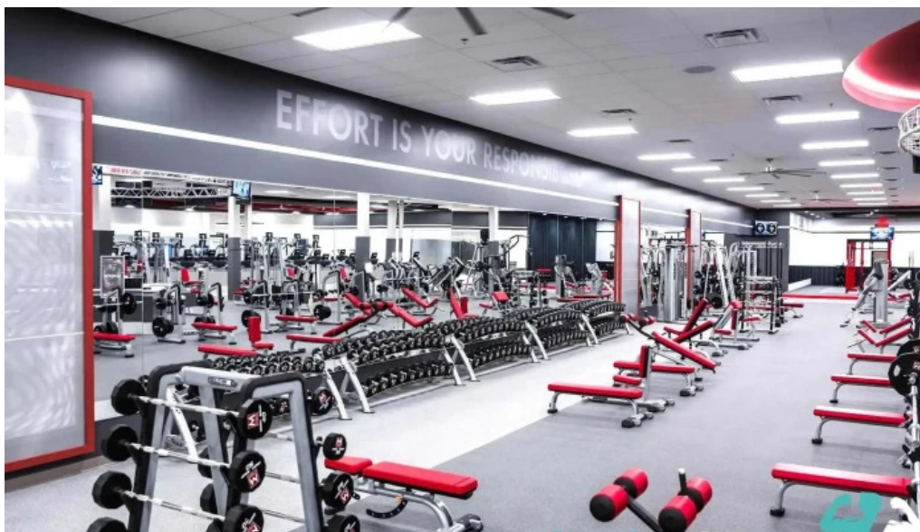
Mountainside fitness ahwatukee by owner