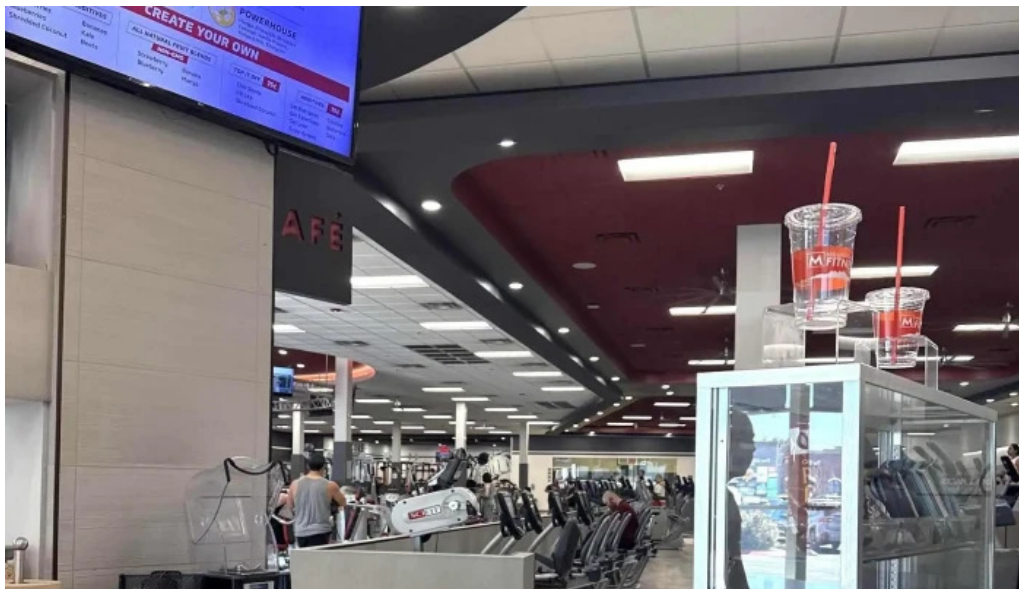
Mountainside fitness ahwatukee phoenix