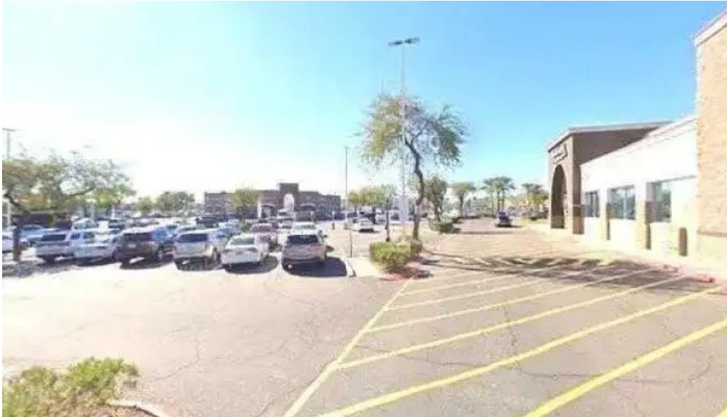
Mountainside fitness ahwatukee street view 360deg