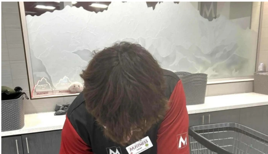
Mountainside fitness ahwatukee fitness center