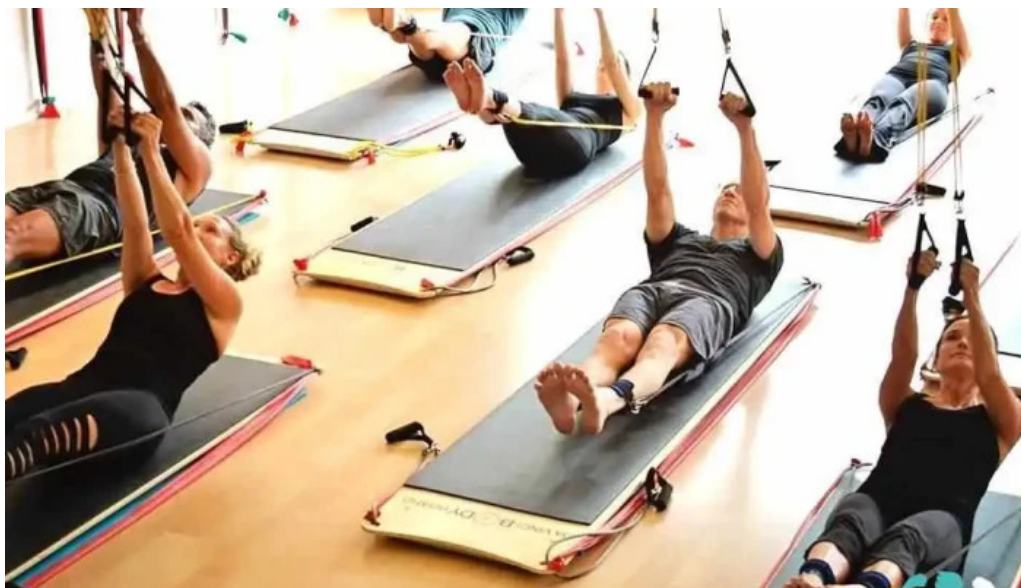
Board30 santa fe da vinci bodyboard gym