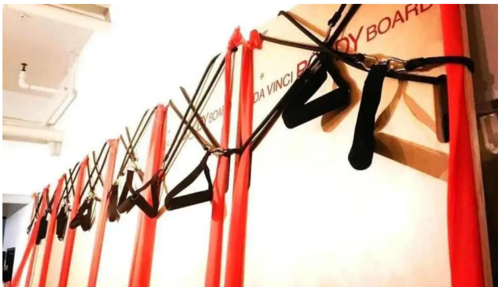
Board30 santa fe da vinci bodyboard by owner