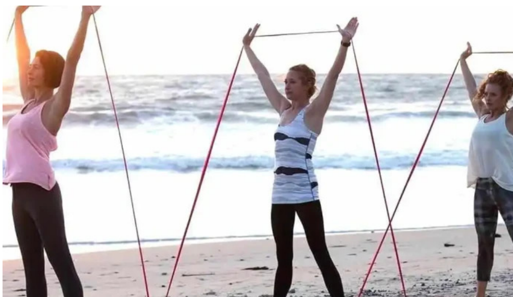
Board30 santa fe da vinci bodyboard all