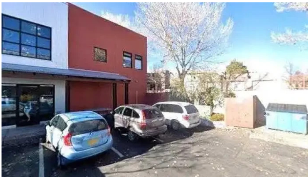
Board30 santa fe da vinci bodyboard street view 360deg