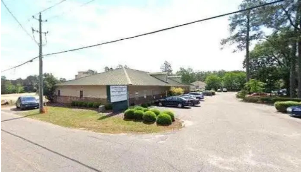
Southern pines crossfit street view 360