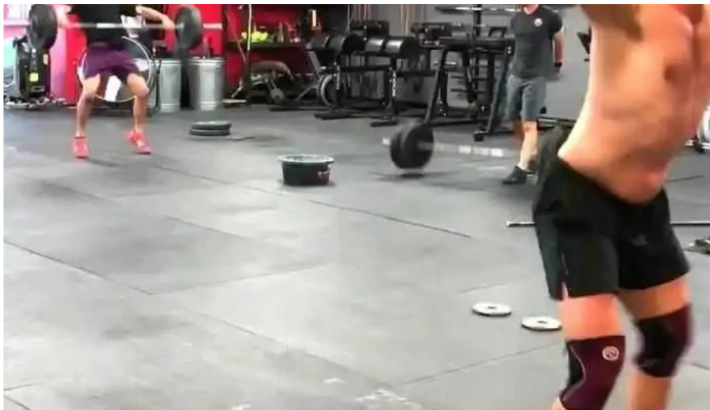
Southern pines crossfit gym