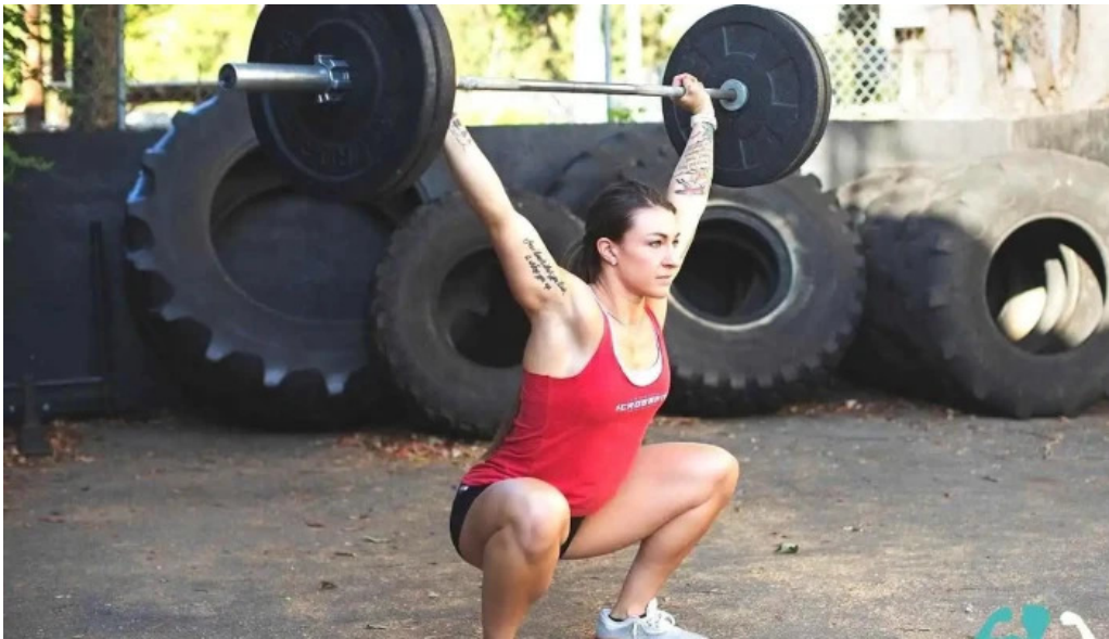
Southern pines crossfit southern pines