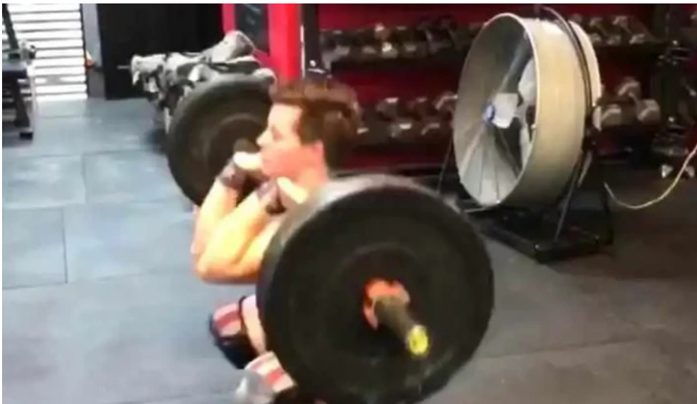
Southern pines crossfit videos