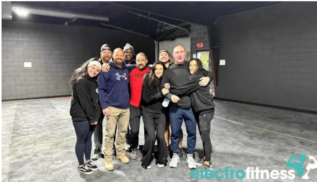
Southern pines crossfit by owner