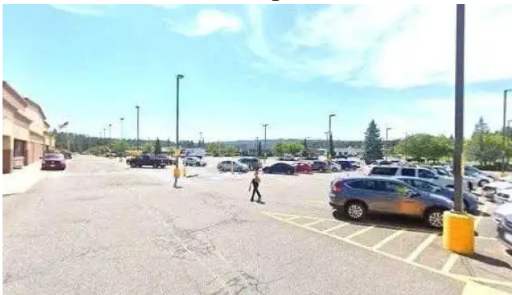
The troop street view 360deg