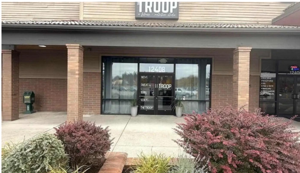
The troop all