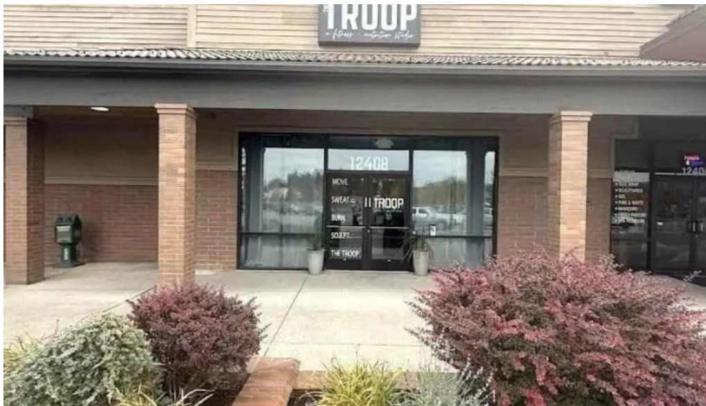
The troop spokane