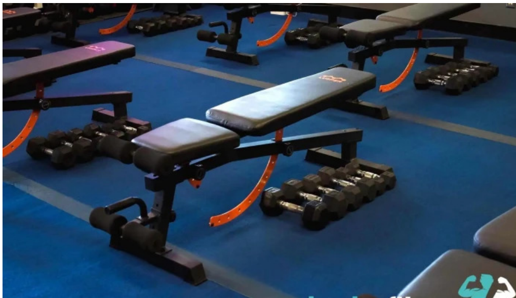
The troop by owner