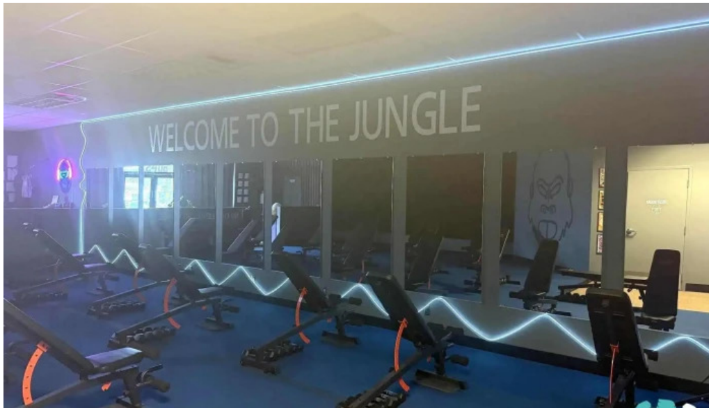
The troop gym