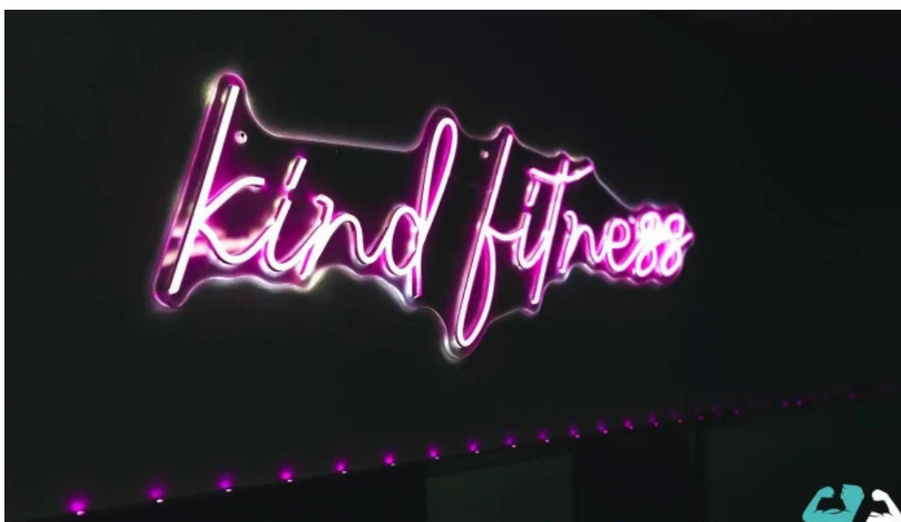
Kind fitness all