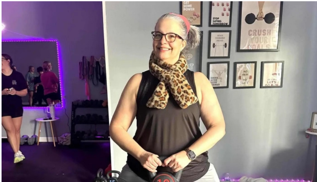
Kind fitness fitness center