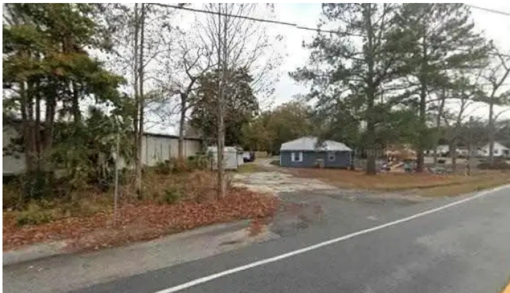
Kind fitness street view 360deg