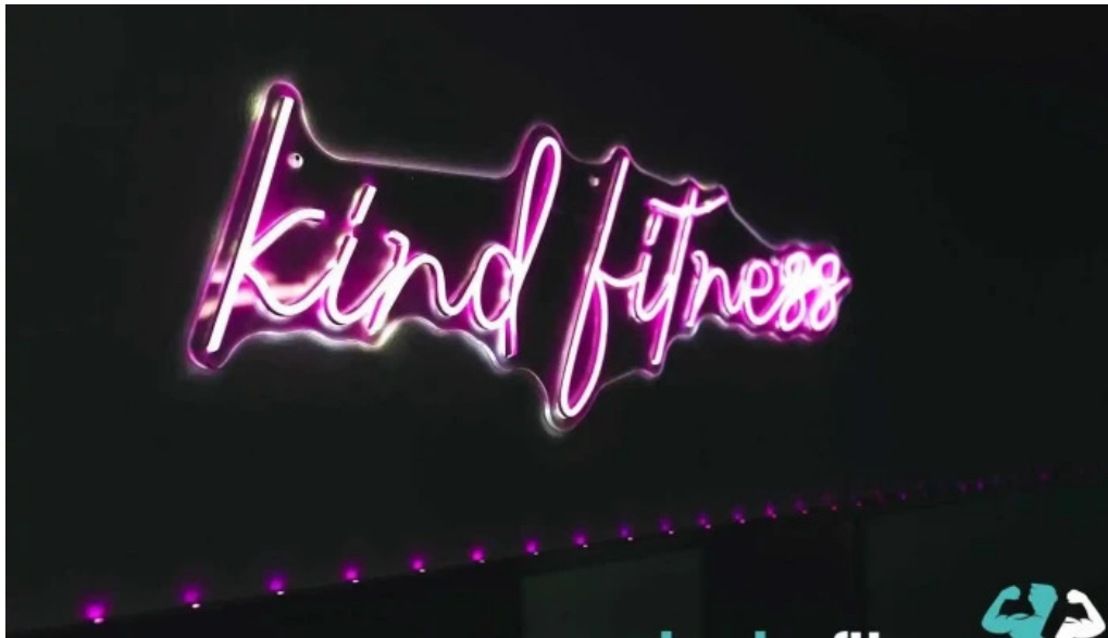
Kind fitness varnville