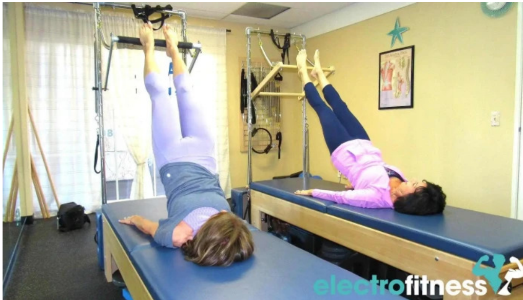
Synrg fitness by owner