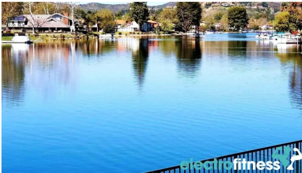
Synrg fitness all