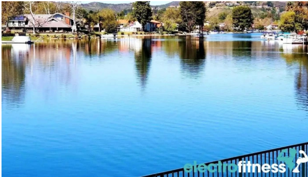
Synrg fitness westlake village