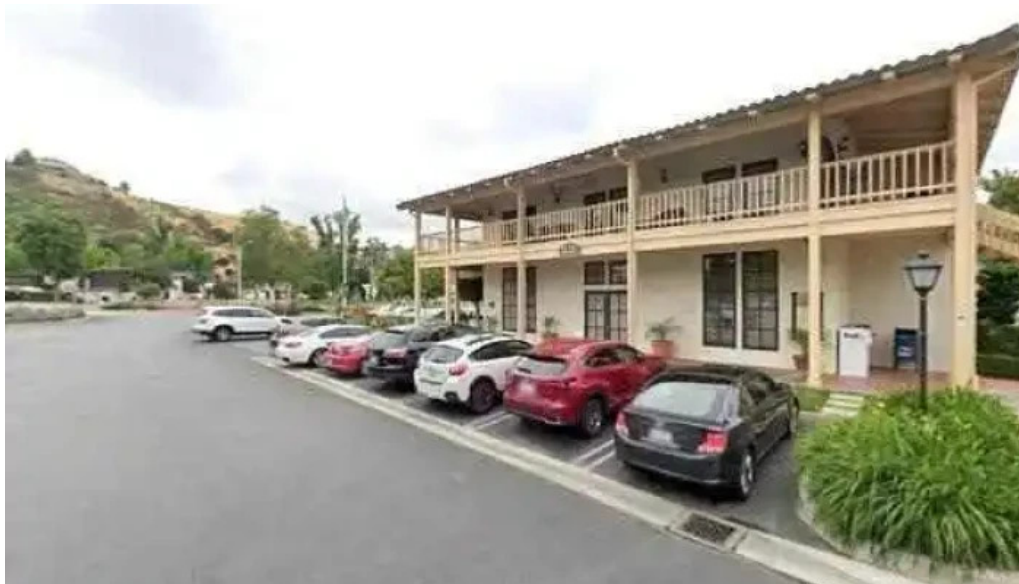
Synrg fitness street view 360deg