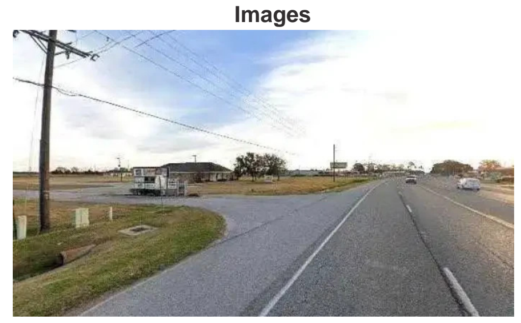
Crossfit cayenne street view 360

If you wish to update any detail that you believe is incorrect about this site, please send us a message and we will correct it promptly. With anticipation we appreciate it.