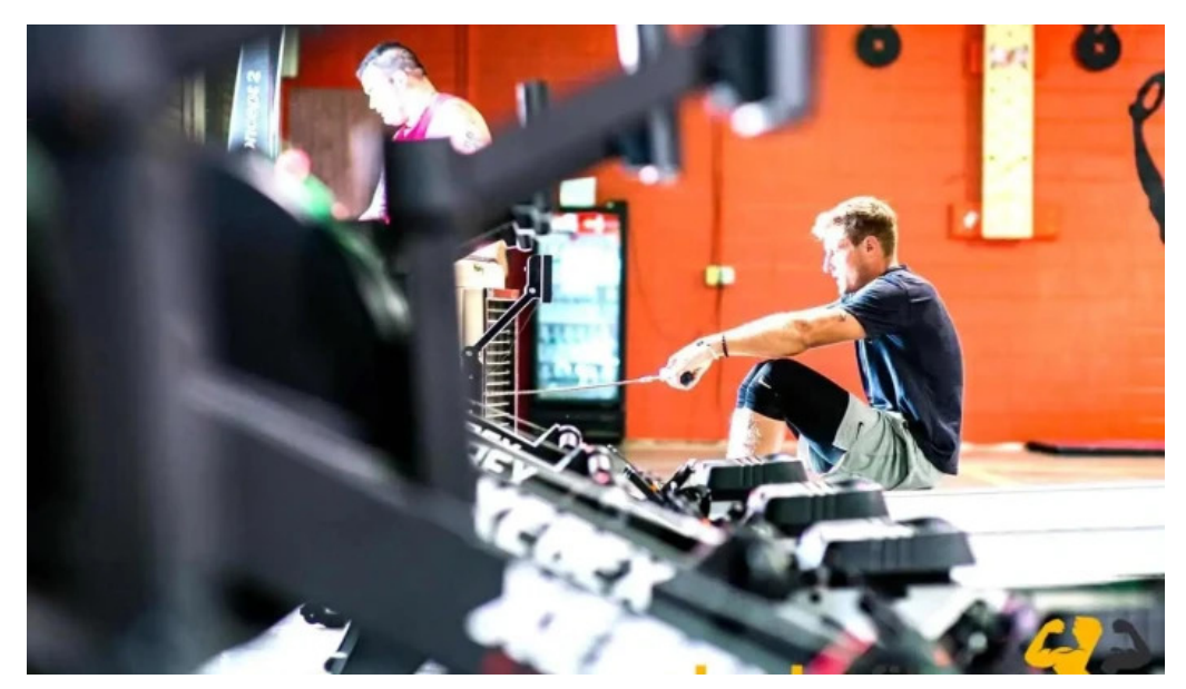
Crossfit cayenne by owner