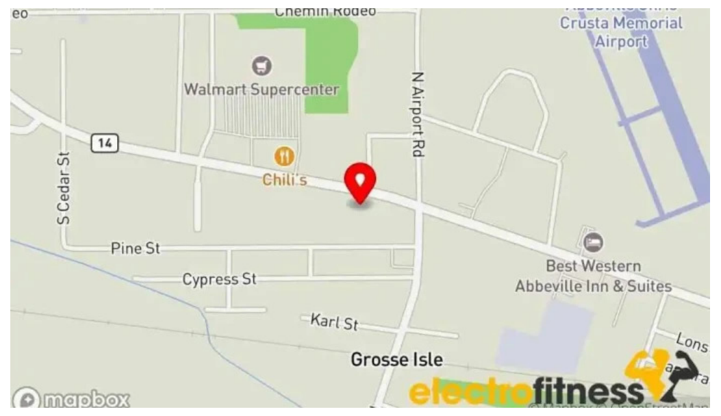
Crossfit cayenne map