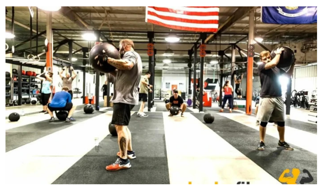
Crossfit cayenne gym