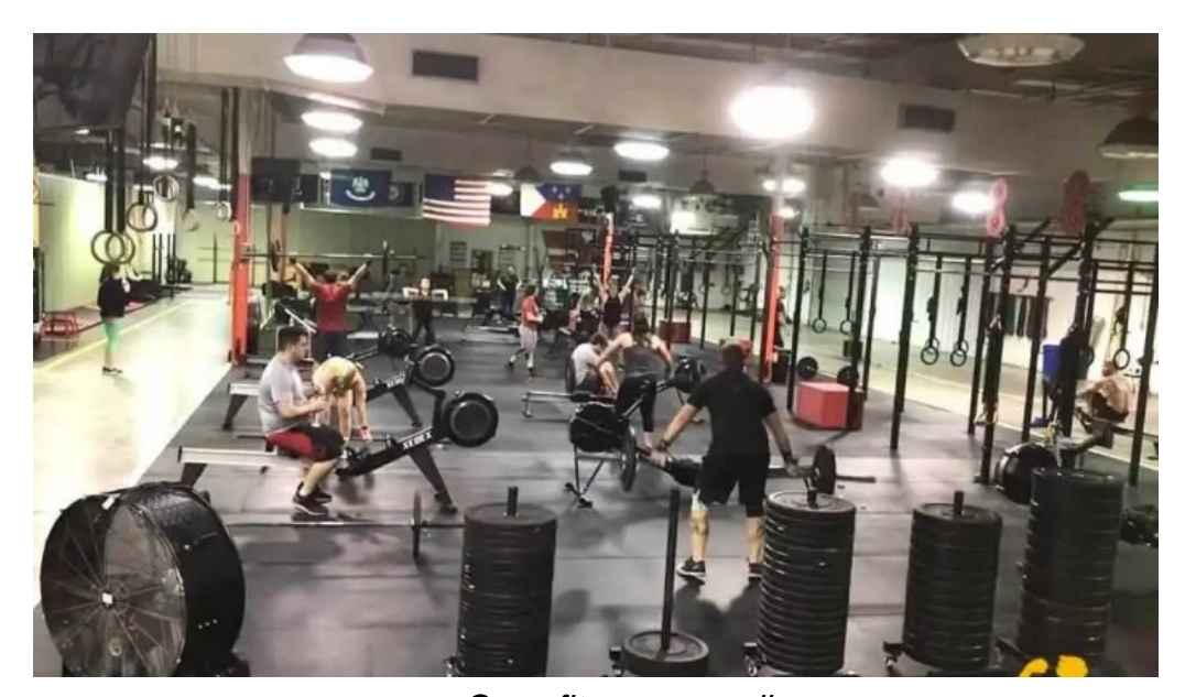
Crossfit cayenne all