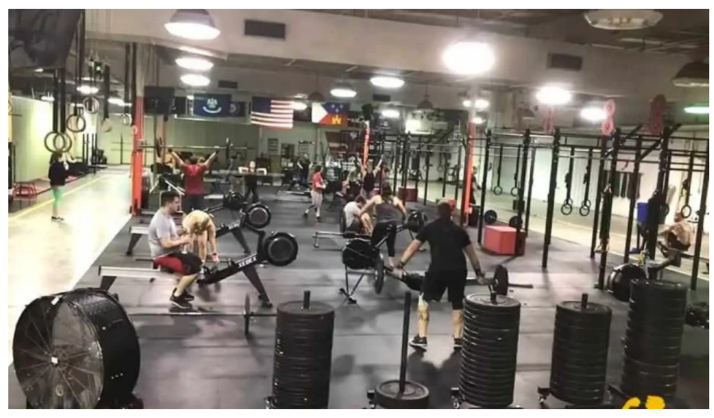
Crossfit cayenne abbeville