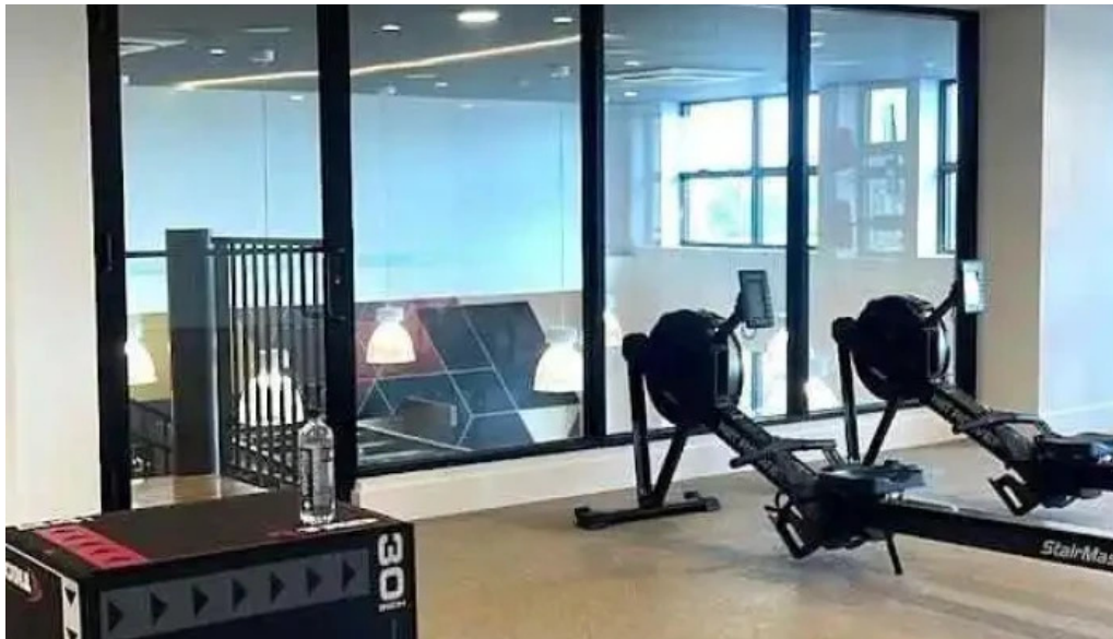
Balance fitness studio aberdeen