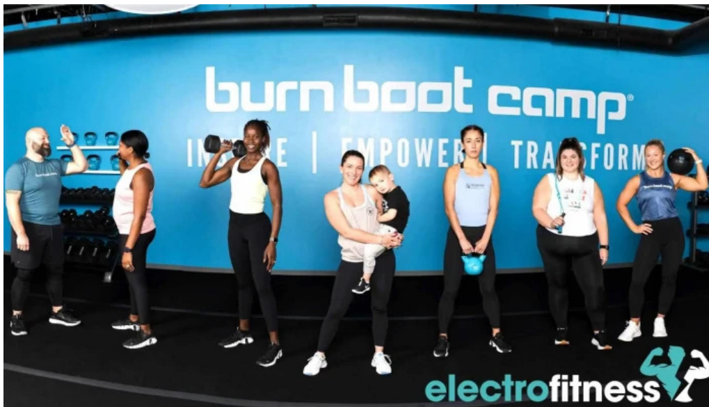
Burn boot camp all