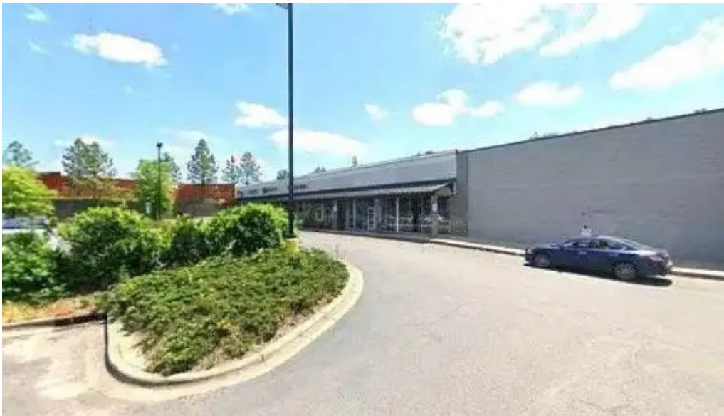
Burn boot camp street view 360