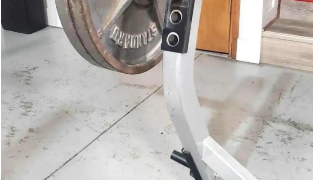
Carolina barbell strength performance gym exercise machine