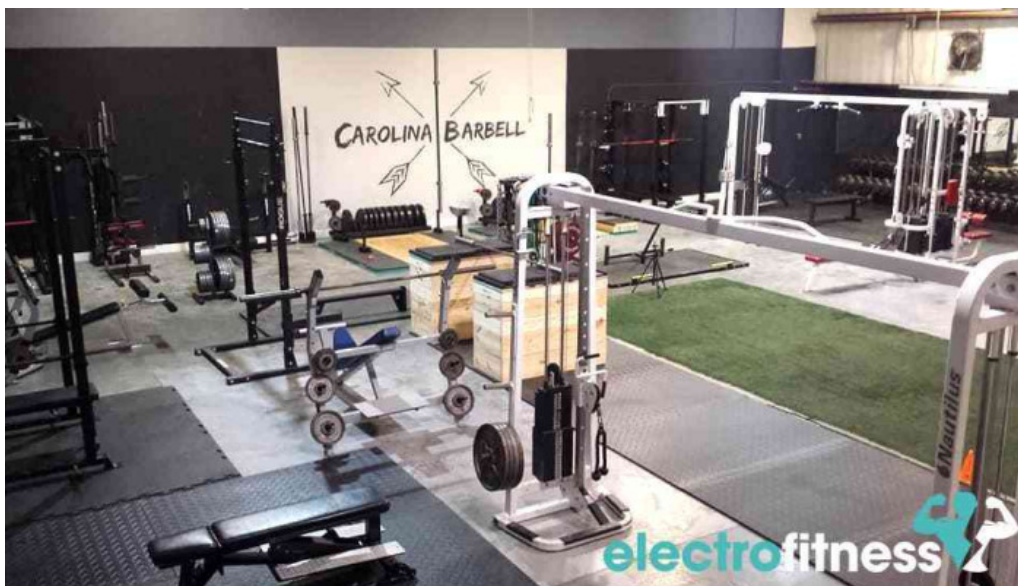
Carolina barbell strength performance gym aberdeen