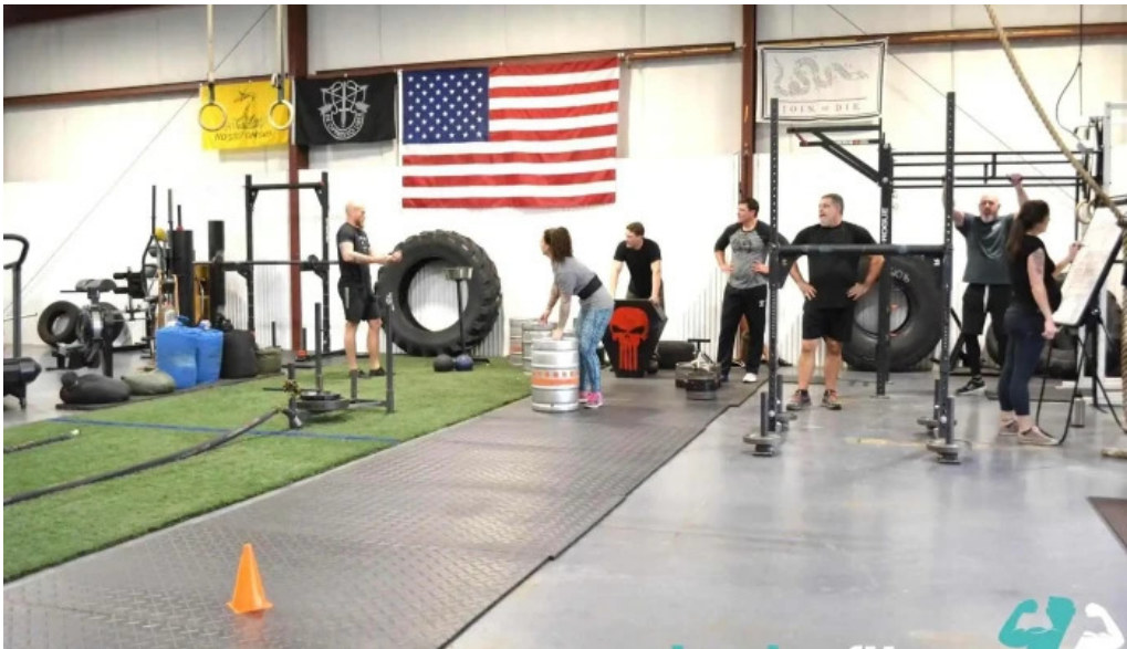
Carolina barbell strength performance gym by owner