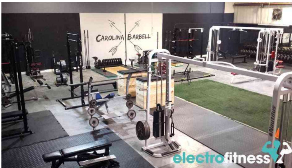
Carolina barbell strength performance gym all