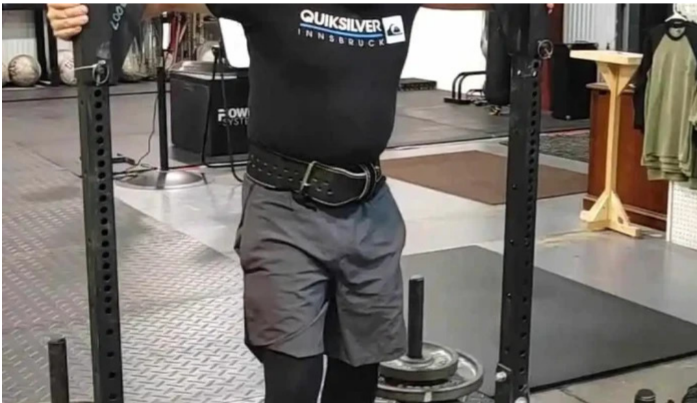
Carolina barbell strength performance gym videos