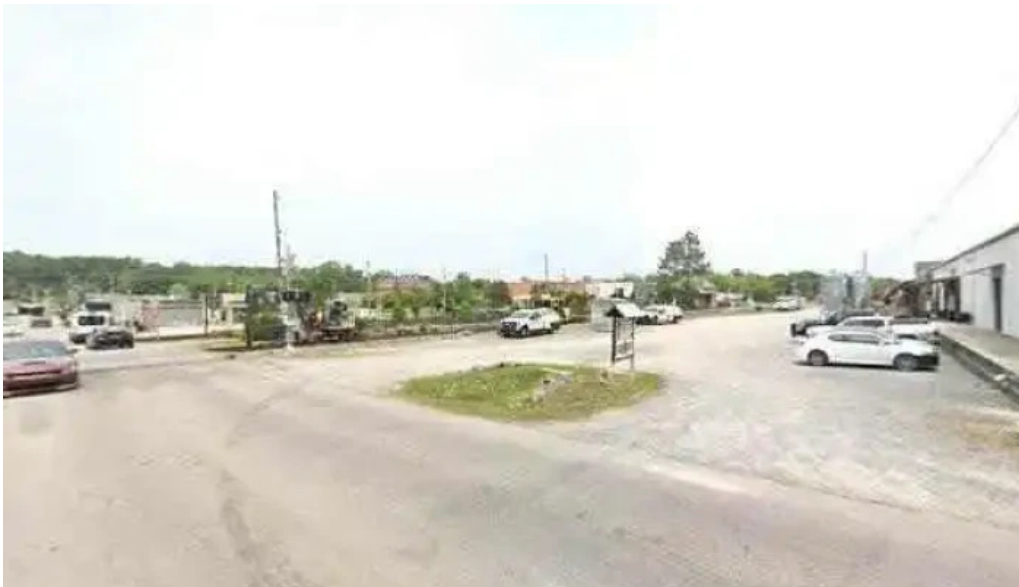
Carolina barbell strength performance gym street view 360