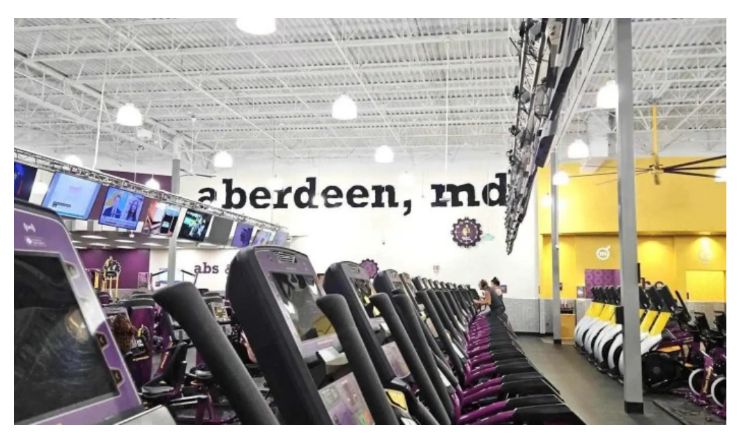
Planet fitness gym