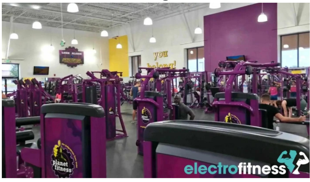
Planet fitness videos