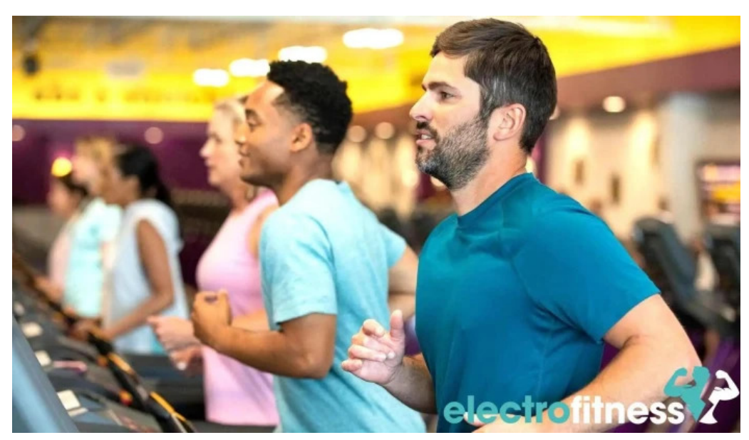
Planet fitness aberdeen