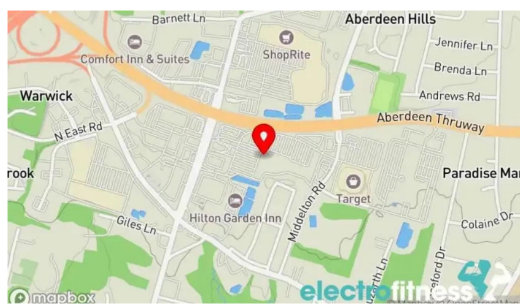
Planet fitness map