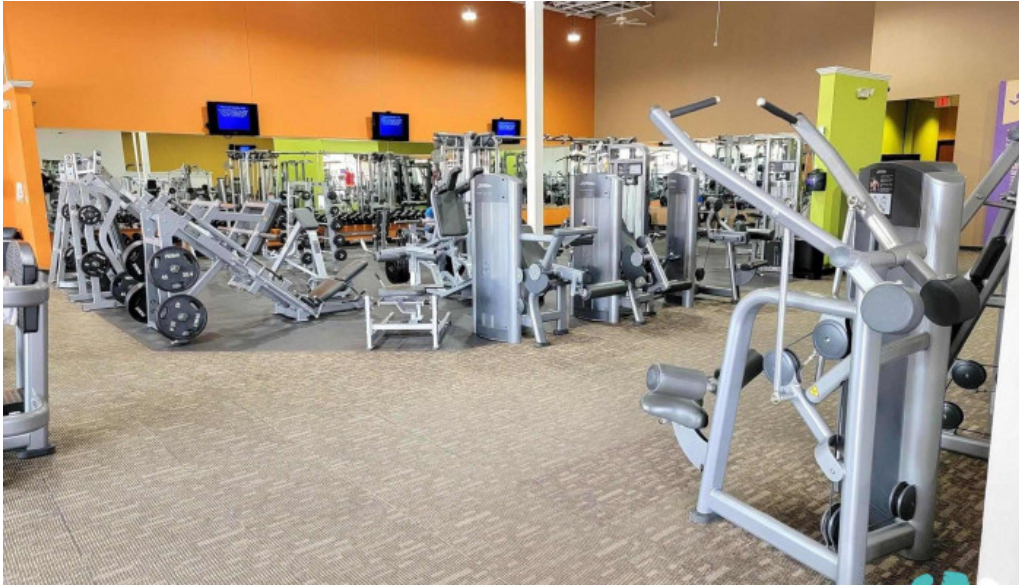
Anytime fitness all