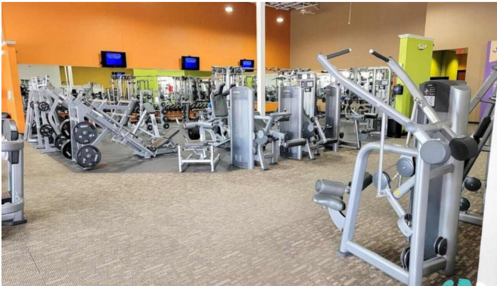
Anytime fitness abilene