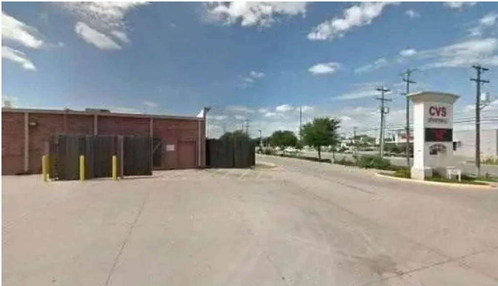
Anytime fitness street view 360deg