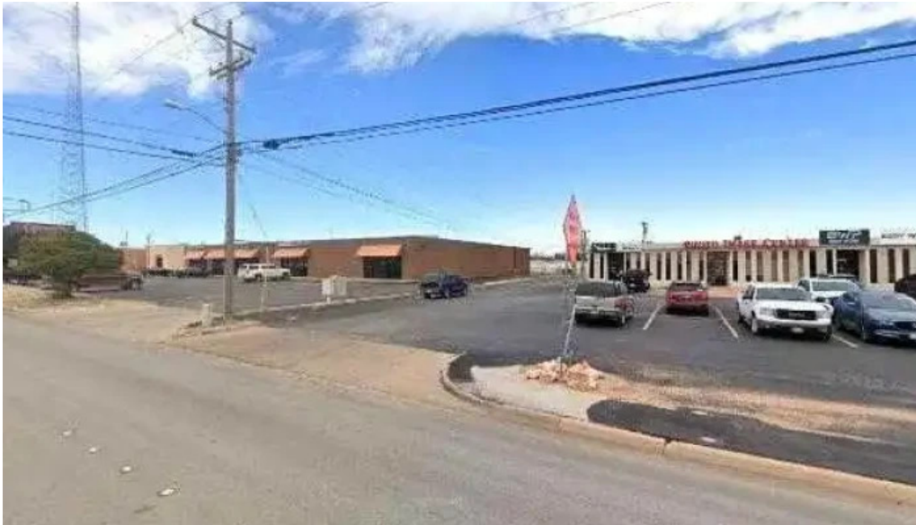
Elevate performance and fitness street view 360deg