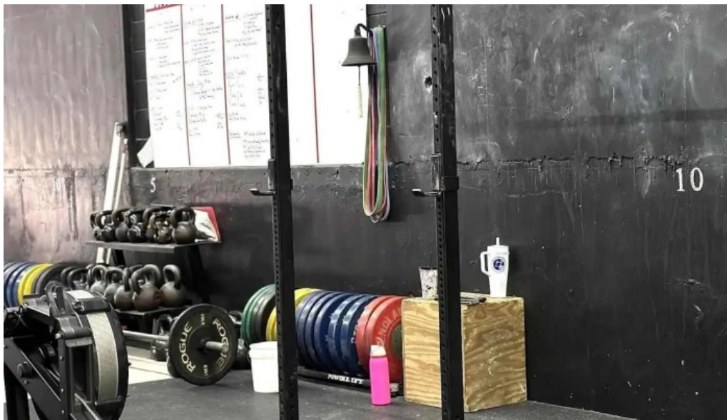
Elevate performance and fitness gym