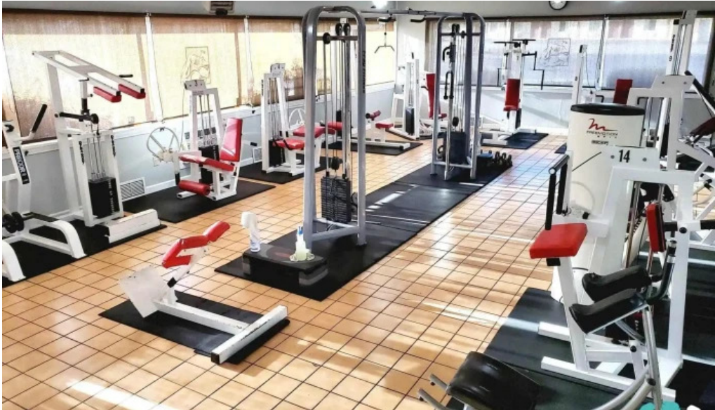
Body by lee exercise machine