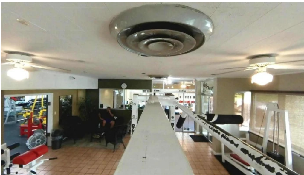
Body by lee street view 360deg