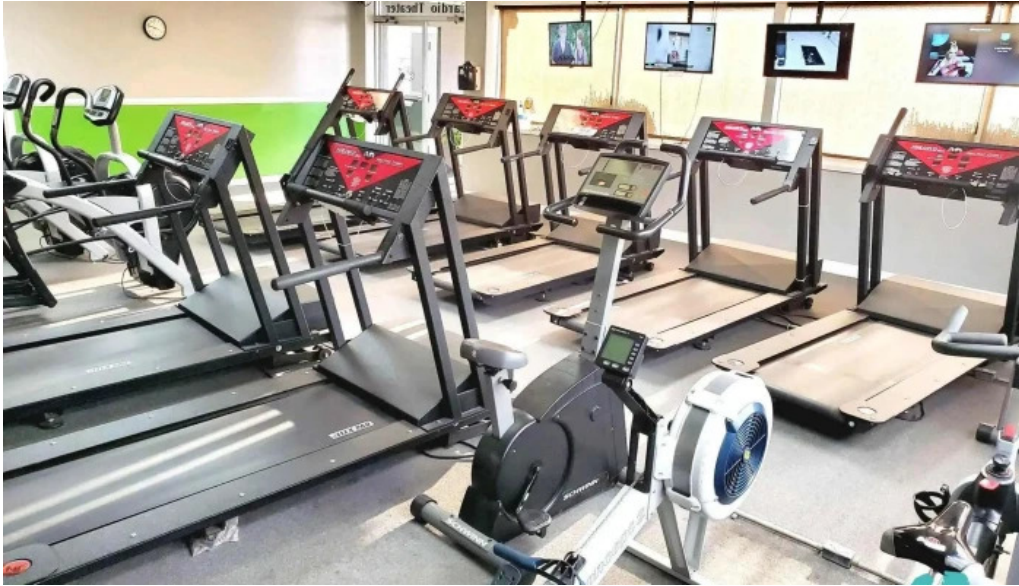
Body by lee all