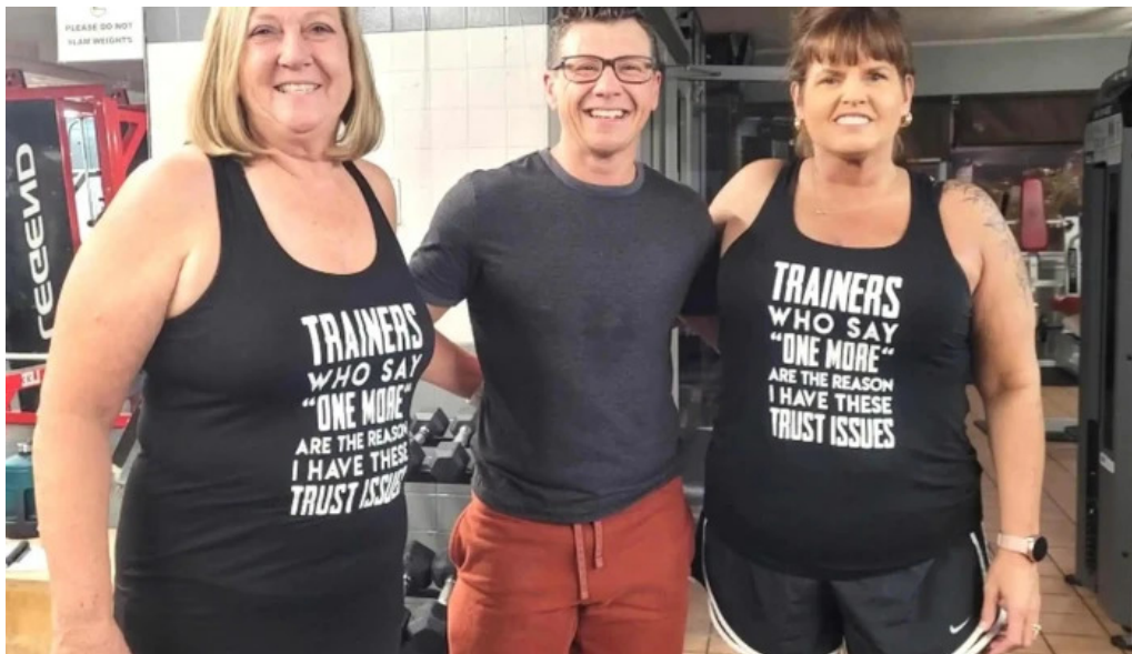
Body by lee gym