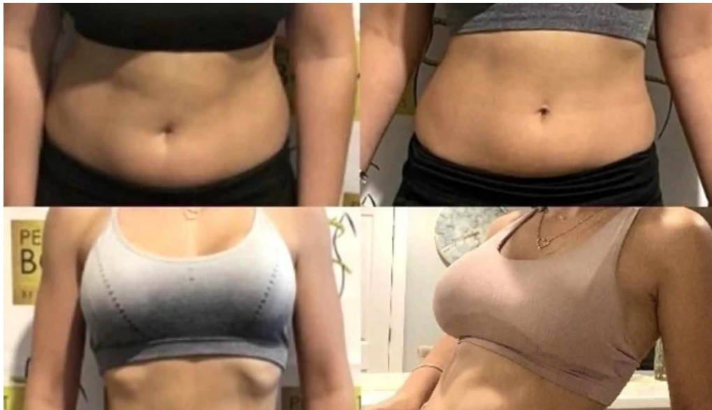
Perfect body by marilia dias abington