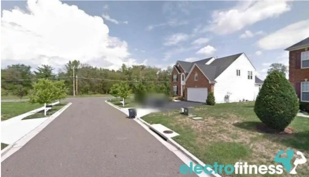
Coach tripps fitness accokeek