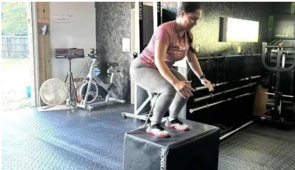
Elevate movement and strength acworth