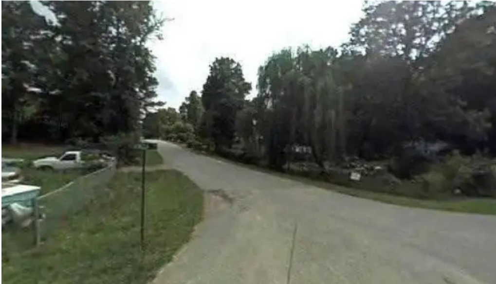
Elevate movement and strength street view 360deg