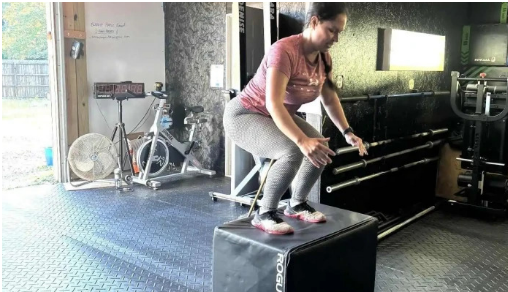
Elevate movement and strength all