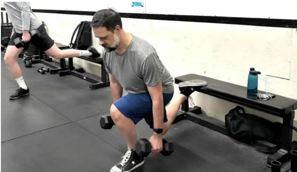
Elevate movement and strength by owner