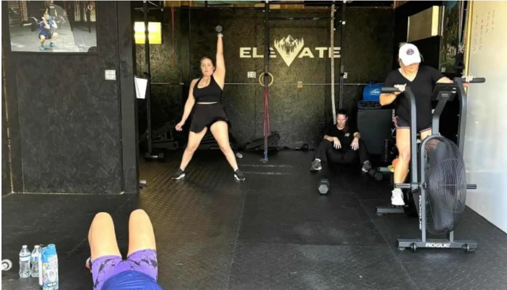
Elevate movement and strength gym