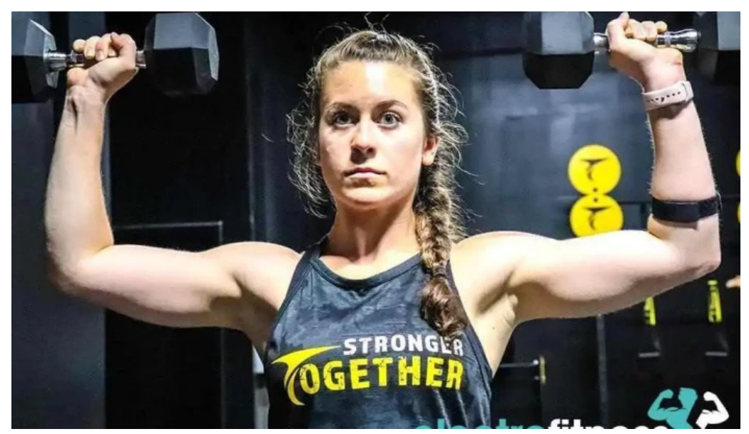
Twisted cycle acworth by owner