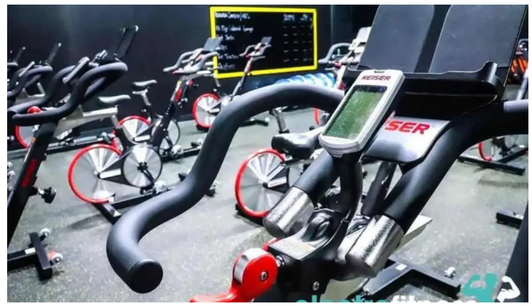
Twisted cycle acworth all