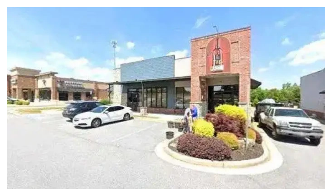
Twisted cycle acworth street view 360deg