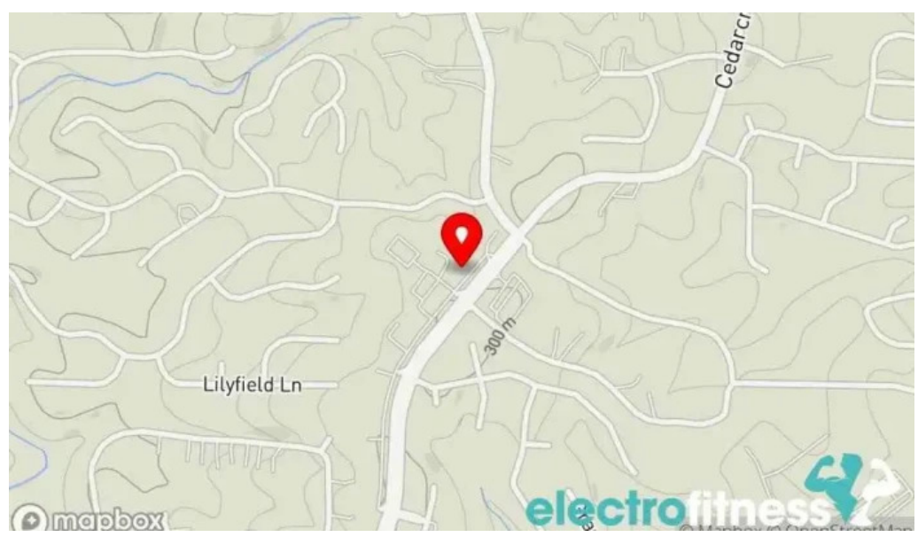
Twisted cycle acworth map