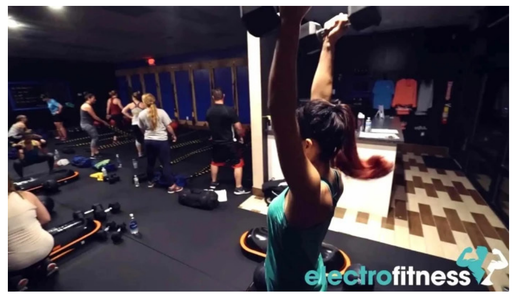
Twisted cycle acworth videos