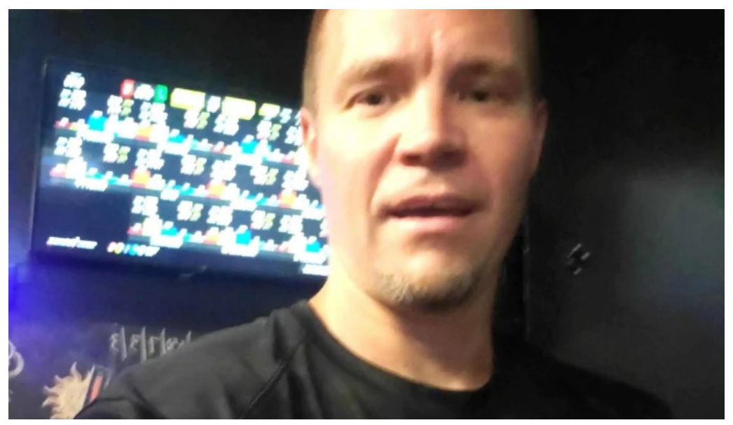
Twisted cycle acworth acworth