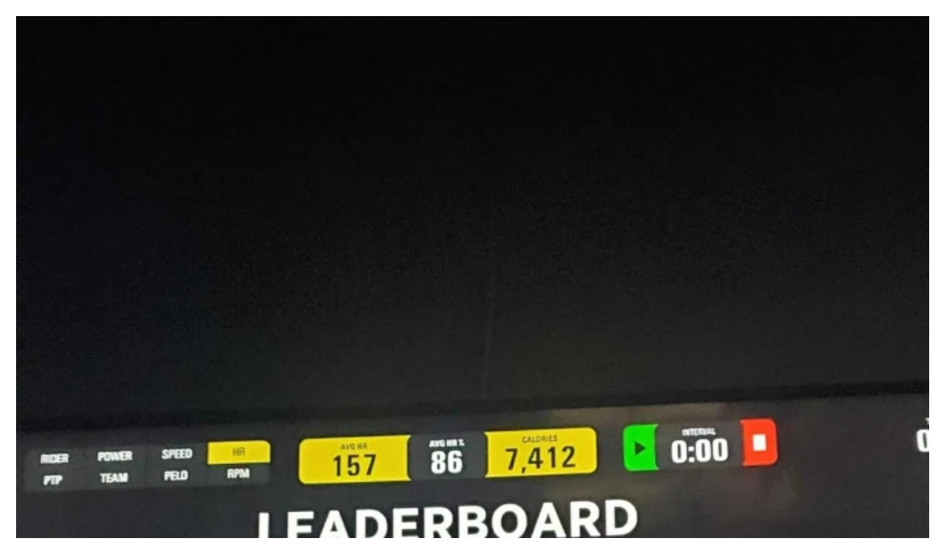
Twisted cycle acworth score