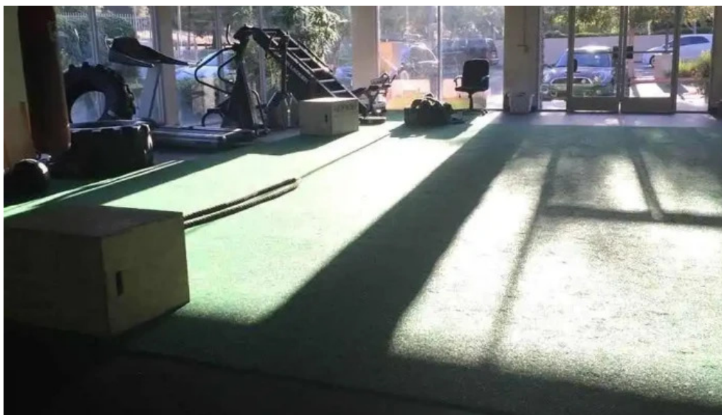
Cheevers fitness agoura hills