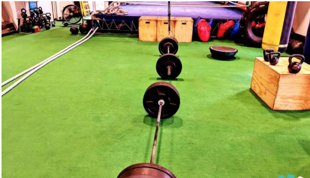
Cheevers fitness gym