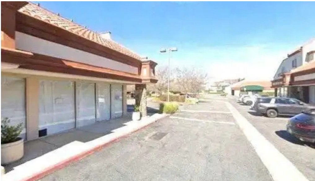
Cheevers fitness street view 360deg